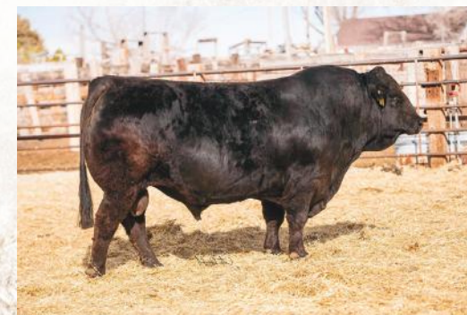
SIRE SYES EASY GOING 77E