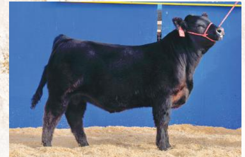
YEARLING PHOTO NATIONAL WESTERN 2022