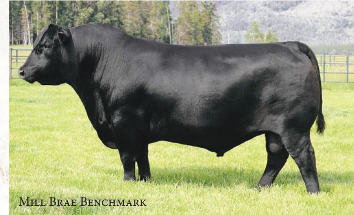
MILL BRAE BENCHMARK