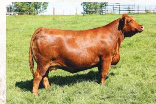
GRAND-DAM ANCHOR B BAILEY