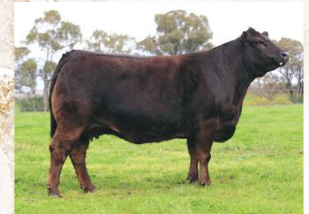
DAUGHTER SUMMIT KRystal L35