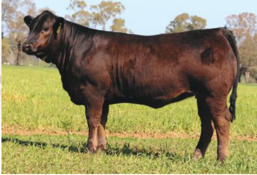
MATERNAL SISTER SUMMIT MAGIC Q32