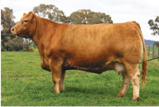
GRAND-DAM SUMMIT MEADOWGRASS H39