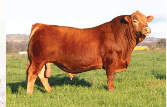
DAM'S FULL BROTHER SUMMIT PATRIOT R53