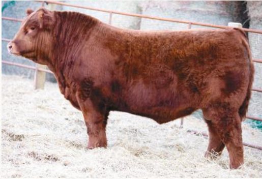
SIRE ANCHOR B GOLD RUSH