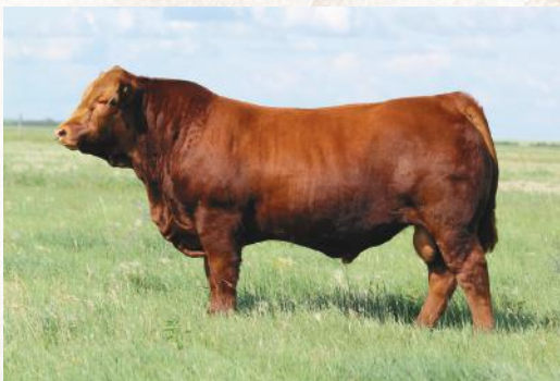
GRAND-SIRE HUNT CREDENTIALS