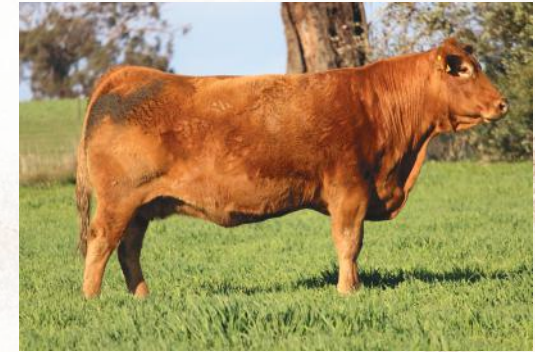
GRAND-DAM PRL LARA G16