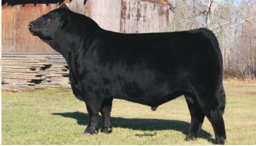
GRAND-SIRE COTTAGE LAKE BIG STAR