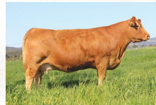
GRAND-DAM SUMMIT EXOTIC P53