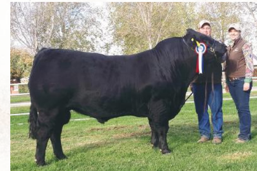
MATERNAL BROTHER SUMMIT PROTOTYPE