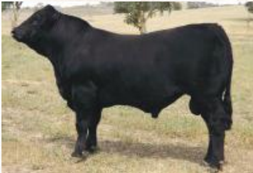
GRAND-SIRE BIRUBI JERICHO J250