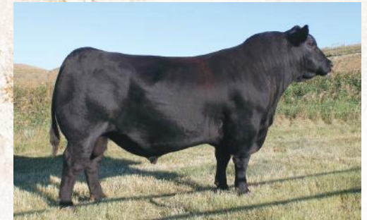
SIRE HOOVER NO DOUBT