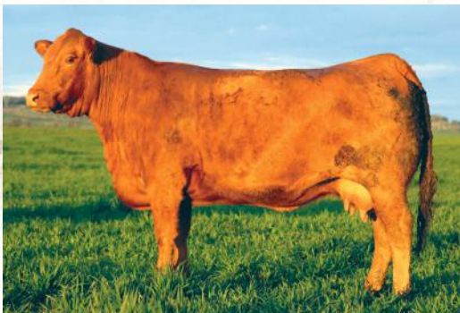
GRAND-DAM BIRUBI WUNDA JINGLES J13