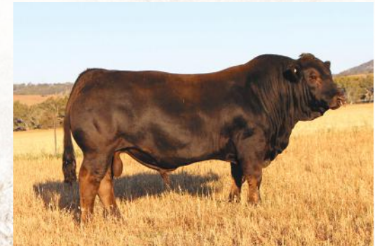
GRAND-SIRE SUMMIT BLUEPRINT M20