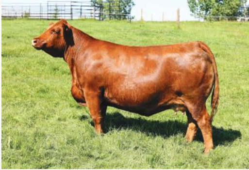
GRAND-DAM ANCHOR B BAILEY