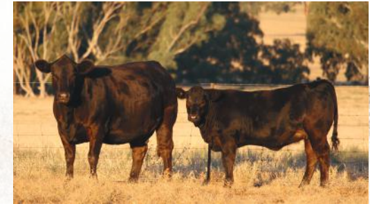
GRAND-DAM SUMMIT EXOTIC H16