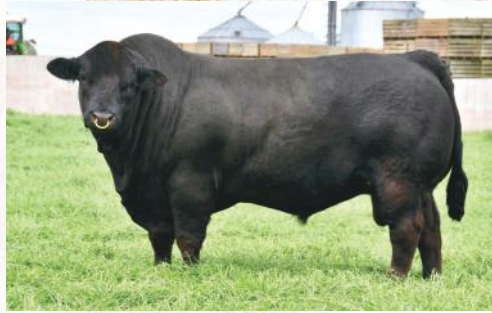
SIRE BALAMORE ENDEAVOR 701E