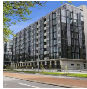
Cooyong St Canberra City ACT