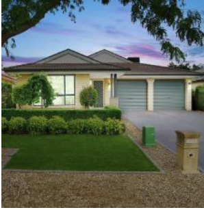
Genoa St Amaroo ACT