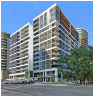
Gribble Street Gunghalin ACT