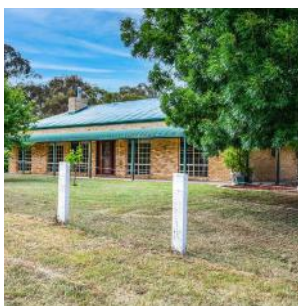
Forbes Creek Road, Forbes Creek NSW