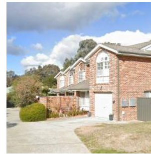
Telopea Pl Queanbeyan NSW