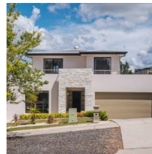
Burgoyne St Bonython ACT