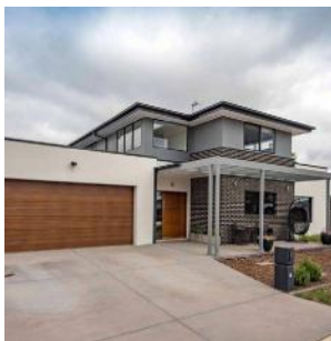
Duncan Loop Googong NSW