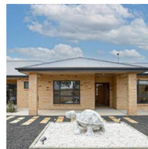
Karinya Plains Michelago NSW