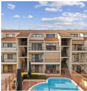
Boolee St Reid ACT