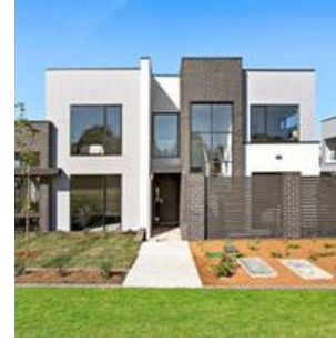
Maclaurin Cres Chifley ACT