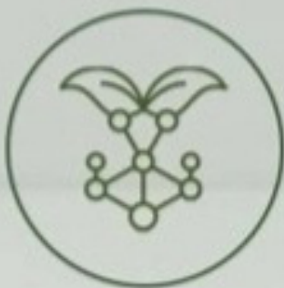
Antioxidants for Protection