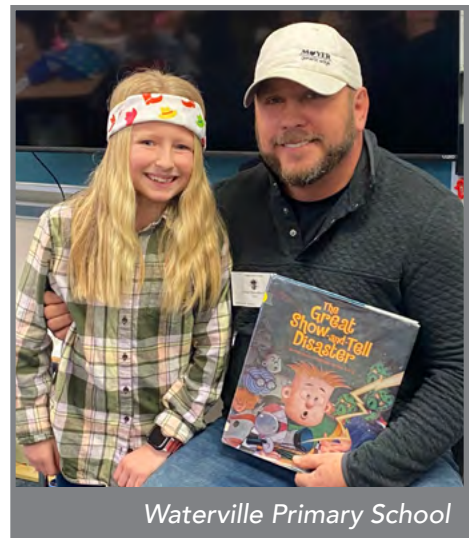
Waterville Primary School

TLCPL Friends of the Library Book Sale April 13-15