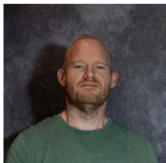
Patrick Bergin Ben Weatherstaff

“I want the audience to experience music, beauty, and love; and witness their power to heal and resurrect a wounded heart.”