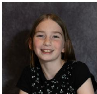
Ann Lillian Whitmore Youth Chorus

“The best part of being in a show like this is how people are always super nice and it is really fun.”