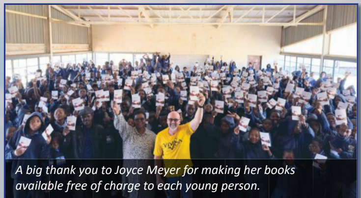
A big thank you to Joyce Meyer for making her books available free of charge to each young person.

The last three weeks of the month were packed. We held thirty events in both local and rural schools. The settings weren't always ideal - sometimes there was no electricity, teachers forgot we were coming, or we only had very limited time to speak. But we showed up and made the most of every moment. We spoke face-to-face to thousands of teens, and hundreds made first-time decisions for Jesus or recommitted their lives to Him - it became the heartbeat of each day. The expressions on the teachers' faces after every session said it all: thank you for coming!