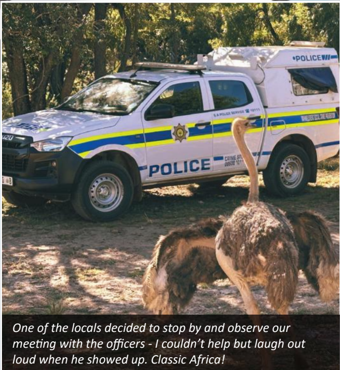
One of the locals decided to stop by and observe our meeting with the officers - I couldn't help but laugh out loud when he showed up. Classic Africa!