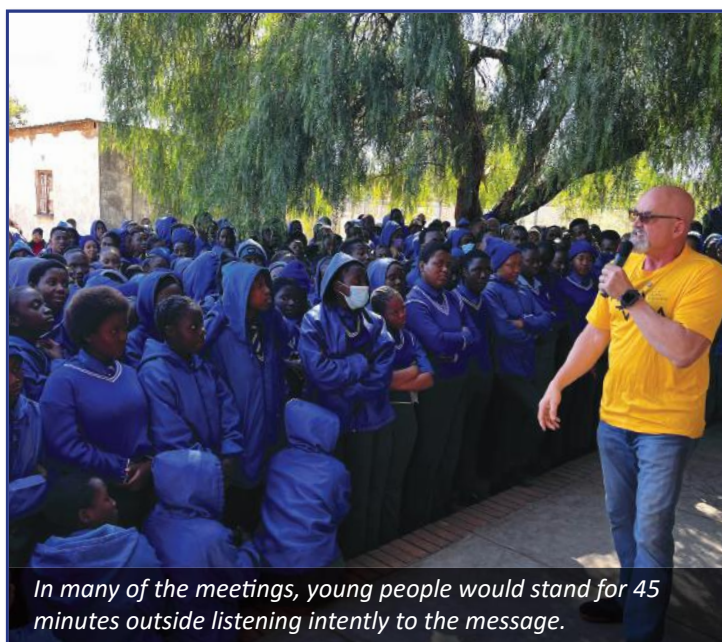
In many of the meetings, young people would stand for 45 minutes outside listening intently to the message.