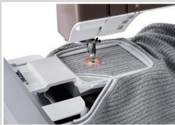
Free Arm Embroidery**