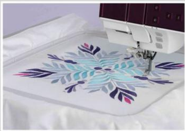
Large Embroidery Area (360 x 350 mm)