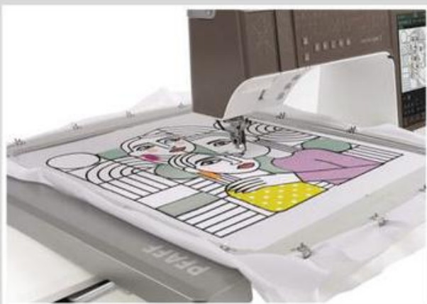
Large Embroidery Area (450 x 450 mm)