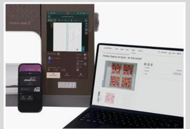
Works With CREATIVATE™

PFAFF, PFAFF PERFECTION STARTS HERE, CREATIVE ICON, CREATIVE, and CREATIVATE are the exclusive trademarks of Singer Sourcing Limited LLC or its Affiliates. © 2026 Singer Sourcing Limited LLC or its Affiliates. All rights reserved. *Offer applies exclusively to the original net purchase price of the Creative Icon 2 sewing and embroidery machine purchased between May 1 - December 31, 2026, at authorized participating PFAFF® Dealers in the USA. Other restrictions may apply. Promotional offer terms and pricing are subject to change. We reserve the right to modify or cancel the promotions at any time at our sole discretion. All consumer pricing is at the sole discretion of the retailer. The trade-up credit is only valid towards an upgrade to a Creative Icon 3 purchased between July 1 - December 31, 2026. **Requires optional accessory.