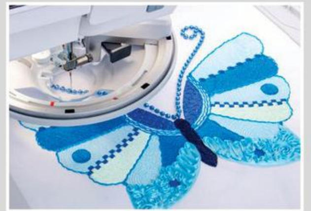
creative ™ Embellishment Attachment**