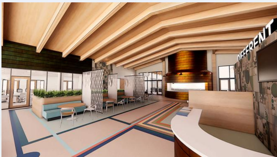
Architectural rendering of (l. to r.) co-working space, cafe, and welcome desk

Opening in Spring 2027, the Community Center will welcome more than 30,000 visitors annually, creating daily opportunities for connection, learning, and inclusion for all. It will also provide meaningful, supportive employment for adults with intellectual and developmental disabilities, addressing an unemployment rate that exceeds 80% nationwide. The Center will be a space to belong, but also a place to work, to grow, and to thrive.