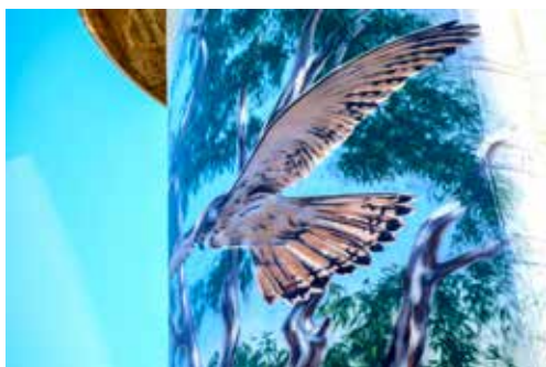
Close up of the Cressy water tower public art