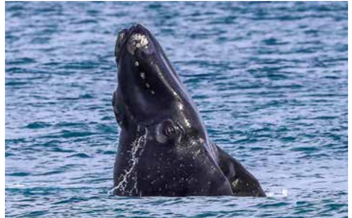
Logans Beach

Victoria is also lucky to have humpback whales pass through our coastal waters. They are most active during their northern migration in June and July, and their southern migration in September and October.