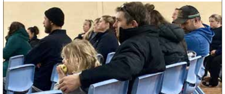
Some of the audience