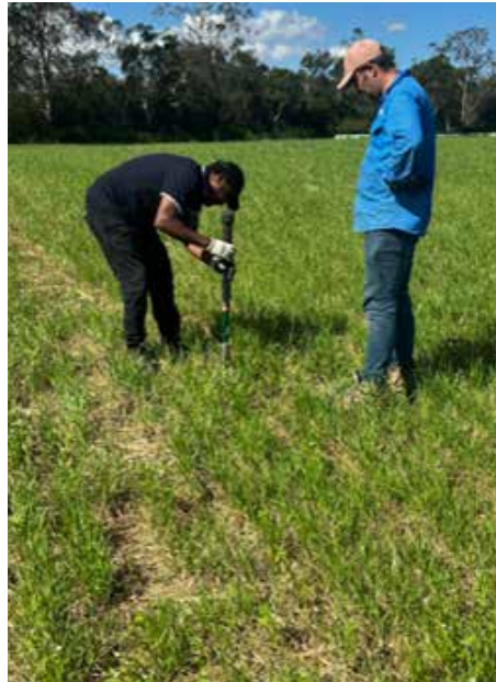
Dairy UP P1d paddock soil sampling

Fluxes refers to kilograms of greenhouse gas emitted or taken-up per hectare each