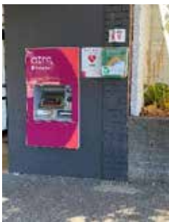
Bendigo Bank 11 Main Street