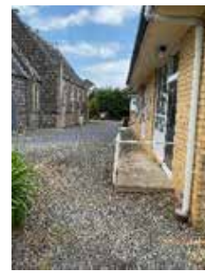
Uniting Church 33 Hesse Street