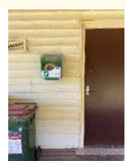
Wurdale Memorial Hall 220 Wurdale Road