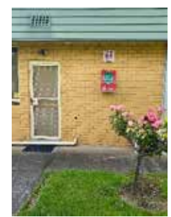
Senior Citizens 36 Harding Street