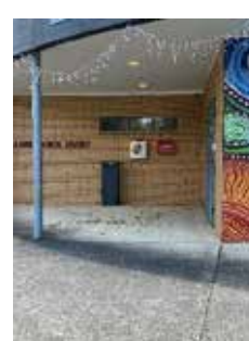
Hesse Rural Health 8 Gosney Street