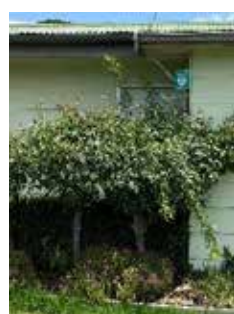
Winchelsea Golf Club 13 Anderson Street