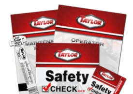
Vehicle Information Package (Standard)