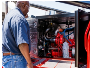
Service & Inspections from Running Board Dual Engine Bay Doors provide full access