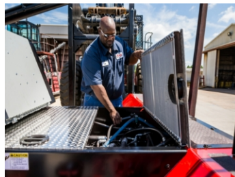
Lightweight Deck Lids provide easy access to Drivetrain & Hydraulics