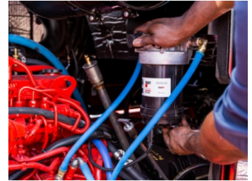
Easy Access to Fuel / Water Separator