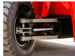
Industry's Toughest Steer Axle (Standard)