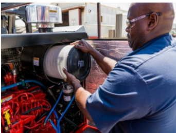
Donaldson Air Cleaner with Safety Element (Standard)