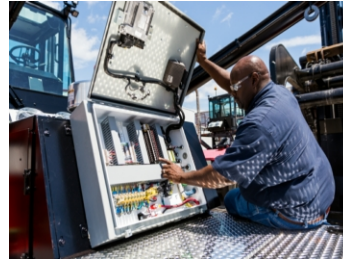
Easy Access to Heavy Duty Circuit Breaker Panel & Breaker Reset Switches