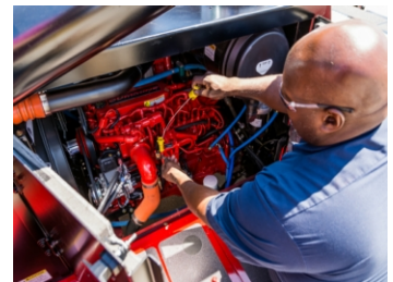
Easily Accessible Daily Checks