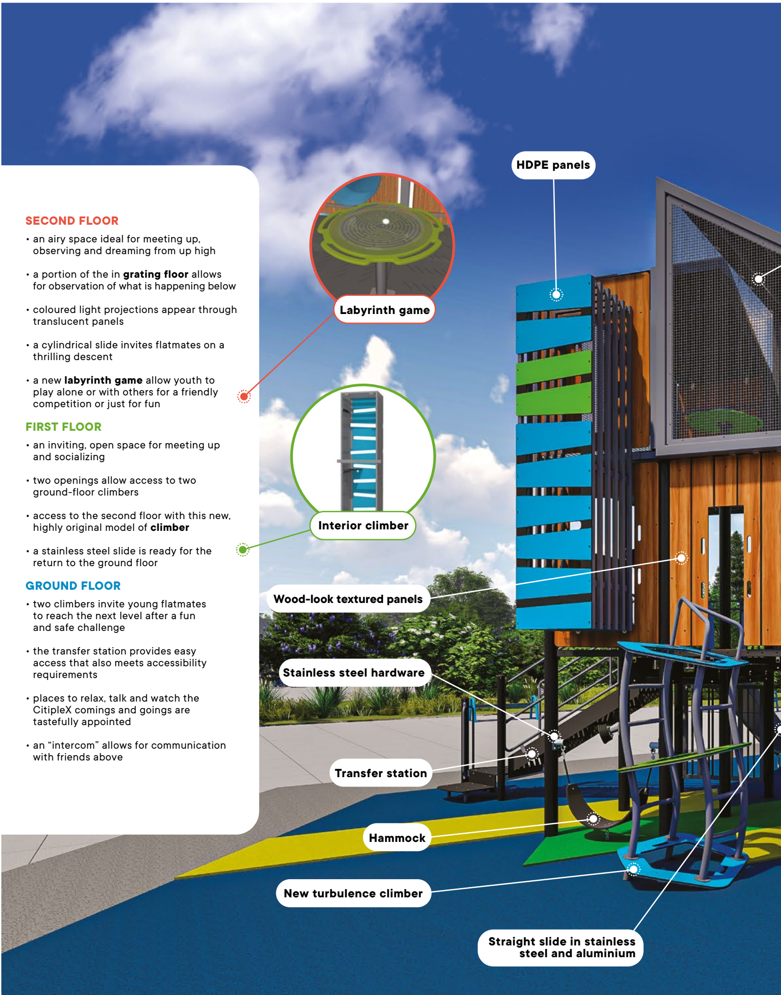
Straight slide in stainless steel and aluminium