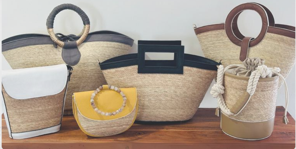
ETERNA 2025 THE COLLECTION