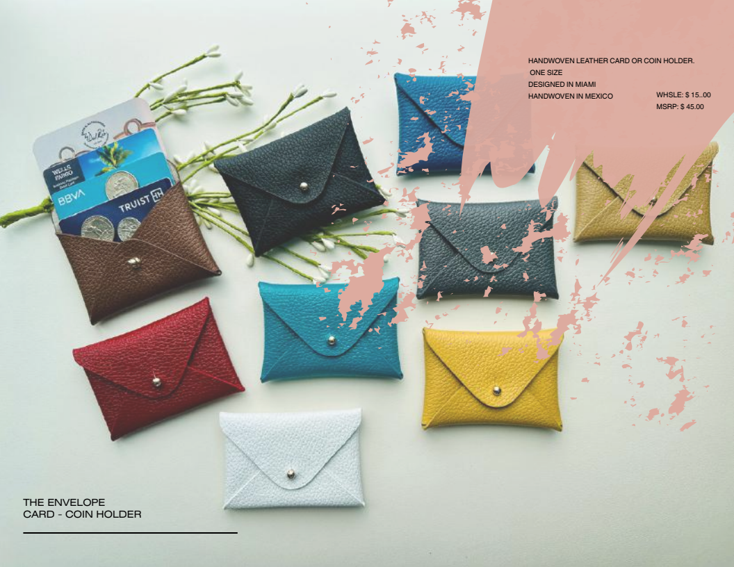
THE ENVELOPE CARD - COIN HOLDER

HANDWOVEN LEATHER CARD OR COIN HOLDER. ONE SIZE DESIGNED IN MIAMI HANDWOVEN IN MEXICO