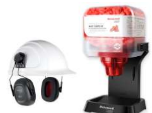
Personal Protection Equipments