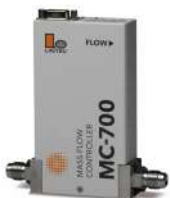
Mass Flow Controllers