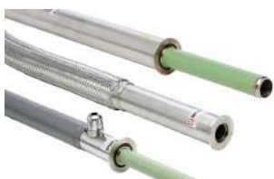
Vacuum Jacketed Pipes & Systems