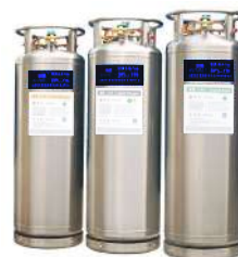
Portable Cryogenic Tank Rental