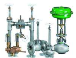
Cryogenic Accessories & Spare Parts