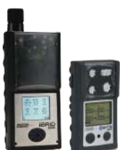
Portable Gas Detectors