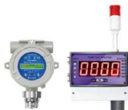
Fixed Gas Detectors