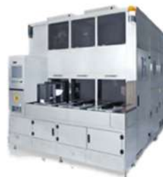
FOUP Cleaning Systems