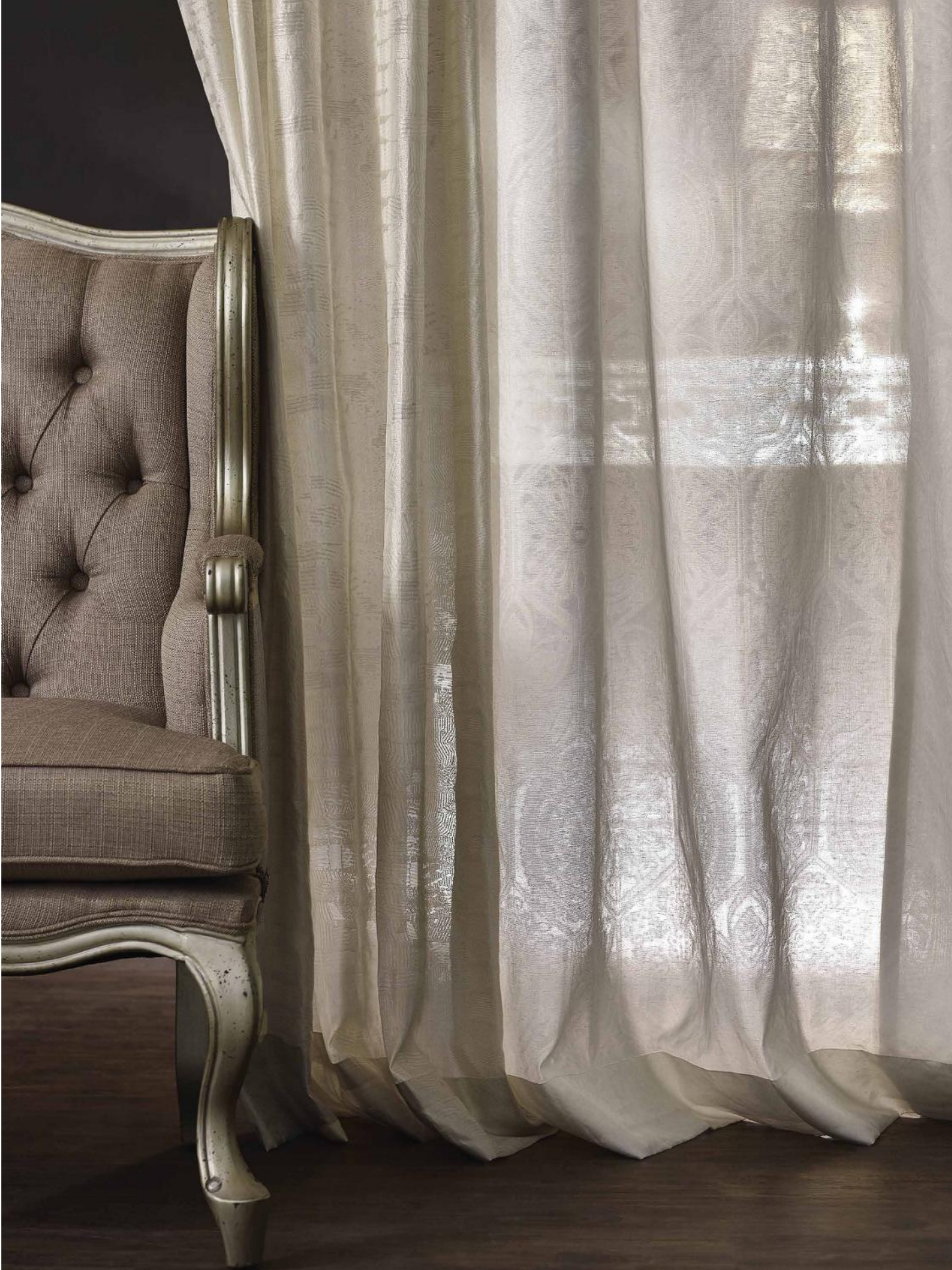
Above — Kenzington Right — Curtain Alpine