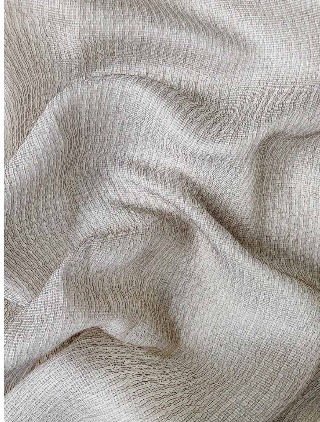
Above — Riverdale Top left — Woodland Bottom left — Scarsdale