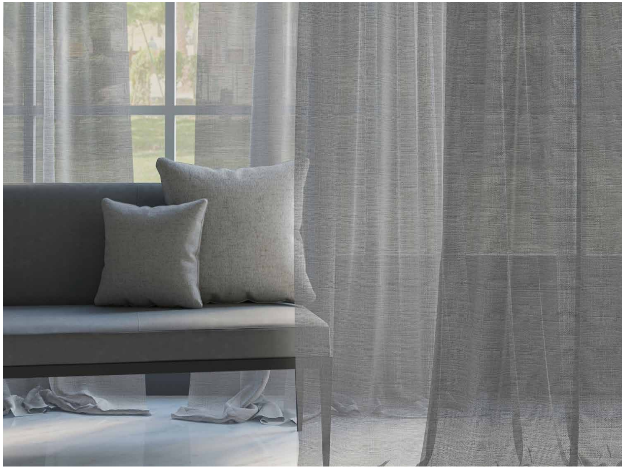
Above — Waterloo Top left — Hastings Bottom left — Acton