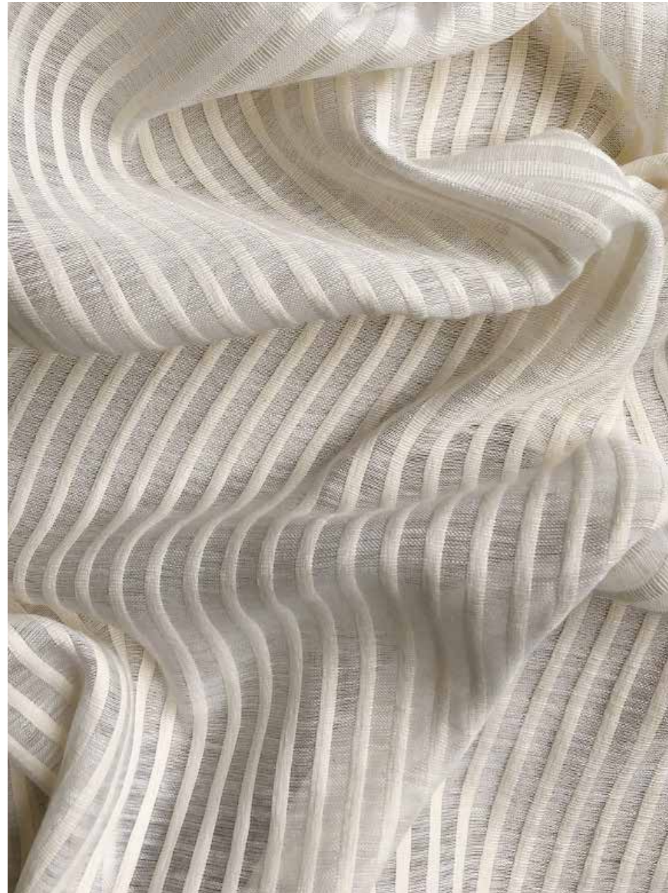
Above — Oakland Right — Belmond, Birmingham, Eclipse Voile, Alpine, Apex Voile