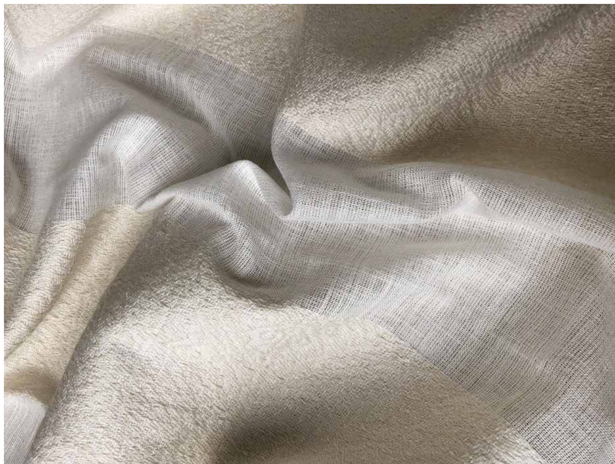
Above — Hampton Top right — Forest Hill Bottom right — Laguna