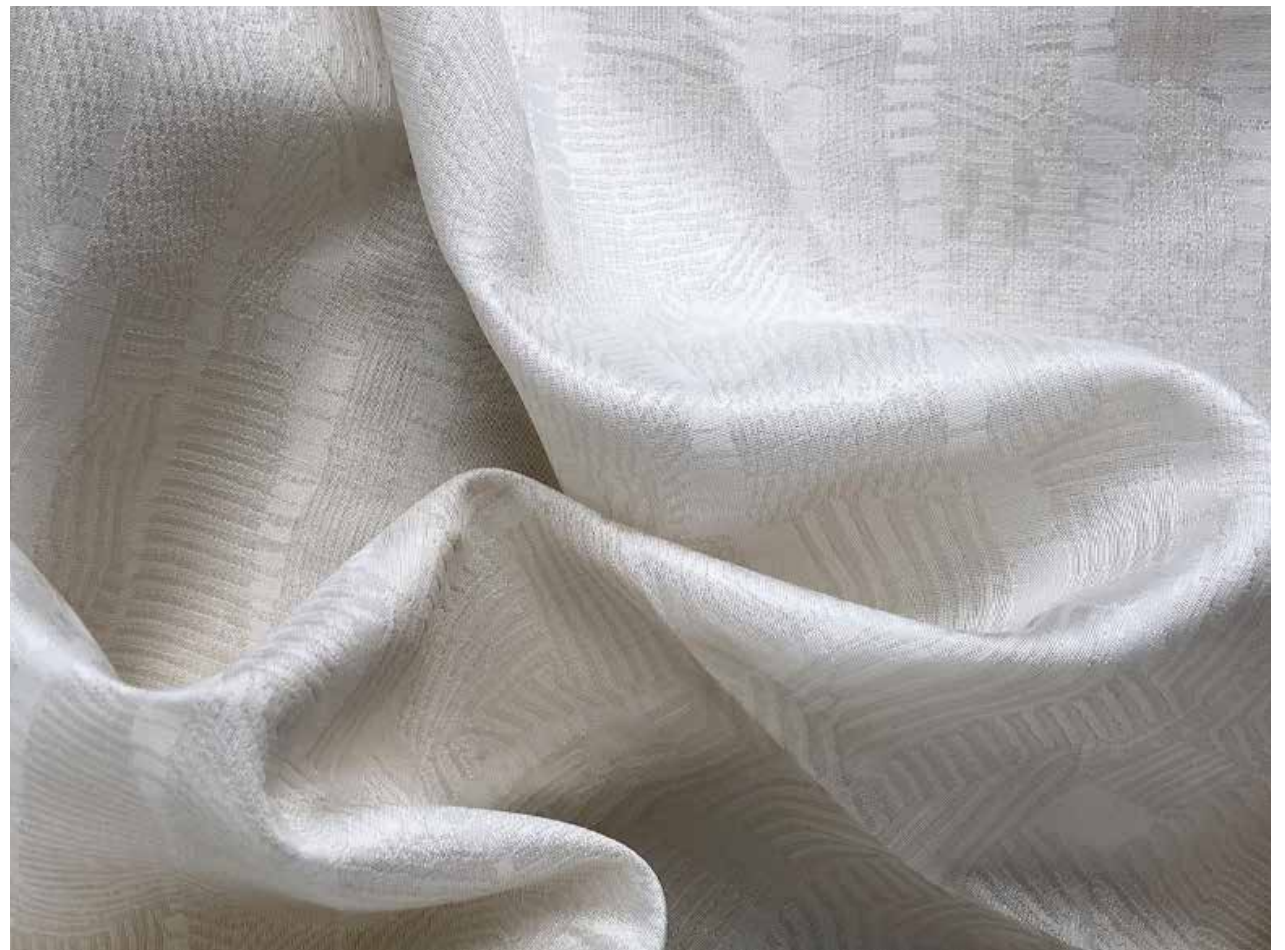
Above — Oakley, Top right — Ducale Voile, Bottom right — Eclipse Voile