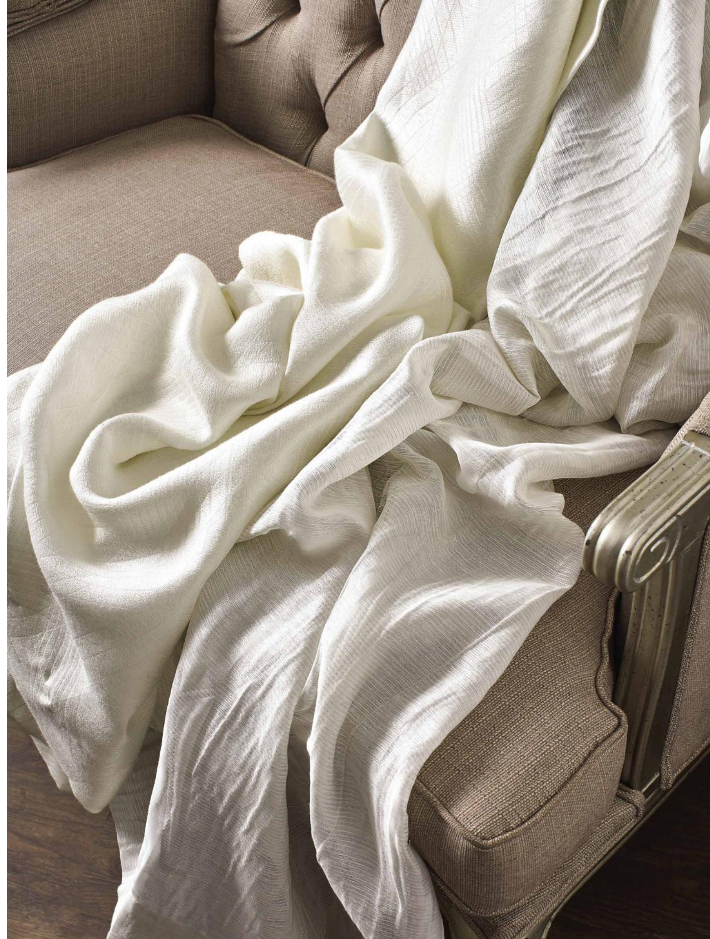
Above — Waterloo Right — Fabrics on sofa Apex Voile, Birmingham