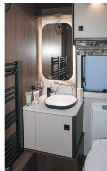
RIGHT Black fittings and a backlit mirror