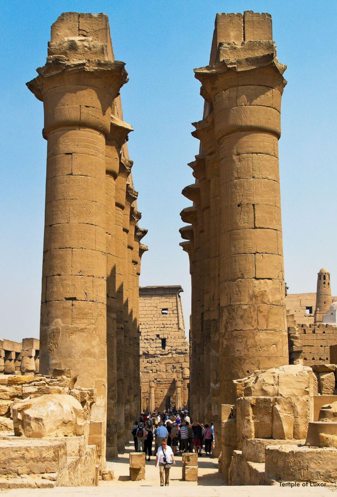
Temple of Luxor