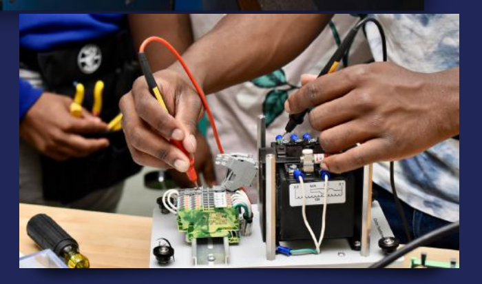
CONTACT US: Phone: (252) 862–1307 Student Services Building, Room 221

Allied Health Business and Industry College & Career Readiness Human Resources Development Manufacturing Public Safety Small Business Center Transportation