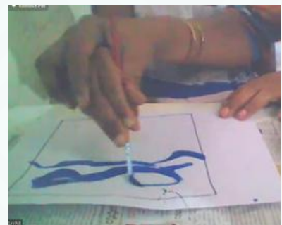
Mixed media art with students of Bubbles Centre for Autism