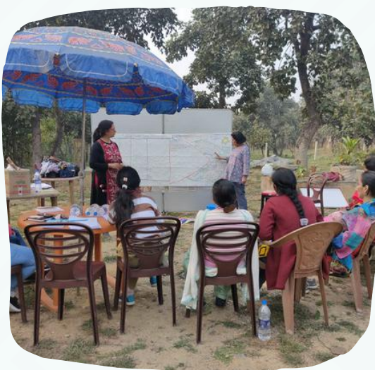
Visit to Bandhu in Purulia district, West Bengal.