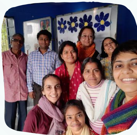
Visit to Transcend Knowledge Society, Kolkata