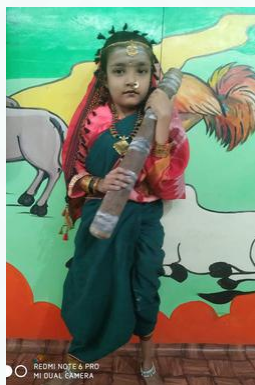
Fancy dress competition!