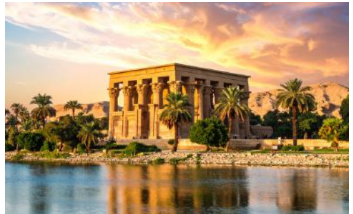
Philae Temple and the High dam

Discover the highlights of Aswan, one of Egypt's most picturesque cities. Visit the beautiful Philae Temple, dedicated to the goddess Isis, and the impressive High Dam. In the afternoon, you may choose to visit a traditional Nubian Village (optional), where you can experience local culture, colorful homes, and warm hospitality.