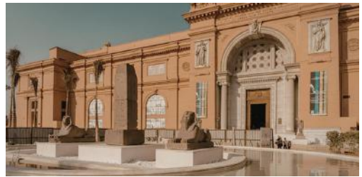
Grand Egyptian Museum, Cairo

Today, explore some of Egypt's most iconic landmarks with your expert Egyptologist guide. Begin at the Grand Egyptian Museum, home to an extraordinary collection of ancient artifacts that bring the story of Egypt's past vividly to life. Continue to the legendary Pyramids of Giza and the Sphinx — timeless symbols of human achievement and mystery. Stand in awe before these monumental structures and take in the vast desert landscape that surrounds them.