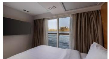
SINGLE CABIN (14m 2 )