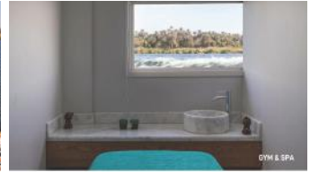
GYM & SPA