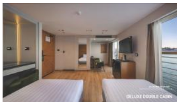
DELUXE DOUBLE CABIN (22m 2 )