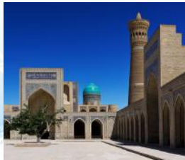
Silk Road Oct 14 - Nov 1, 2027