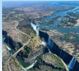
Southern Africa: Safaris and Falls Mar 5 - 19, 2027