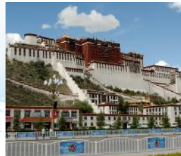
China and Tibet Sept 12 - 28, 2027