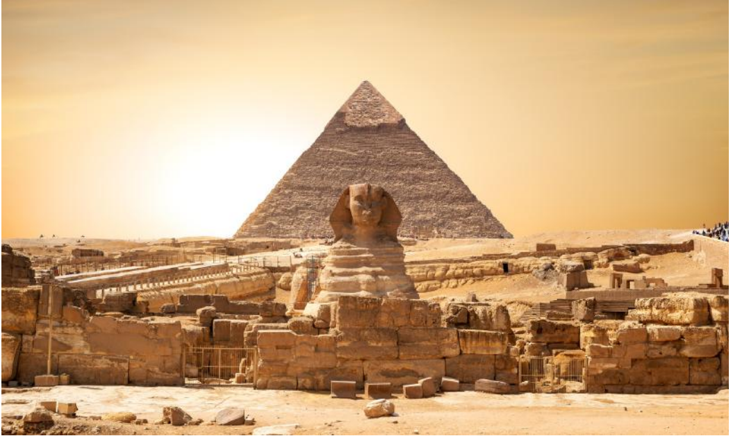
Pyramids & Sphinx, Cairo