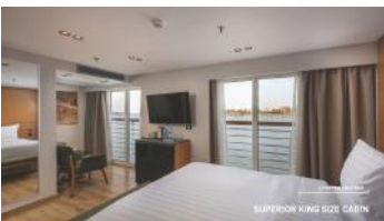
SUPERIOR KING SIZE CABIN (22m 2 )