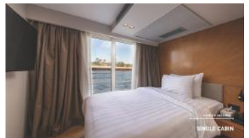
SINGLE CABIN (14m 2 )