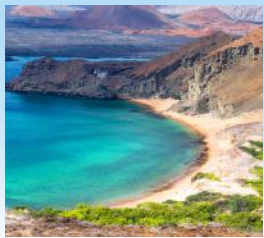
Ecuador & Galapagos May 17 - 27, 2027