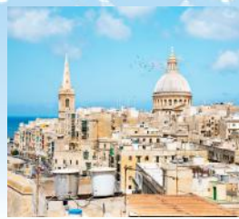
Malta to Italy Sept 14 - 28, 2027