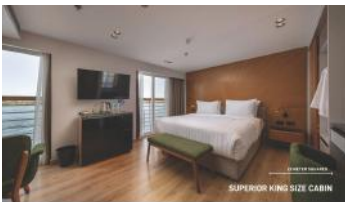
SUPERIOR KING SIZE CABIN (22m 2 )