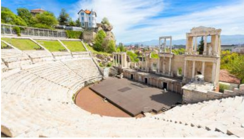
Pompey's Pillar, Roman Theater

Accommodation: Hilton Alexandria Cornish hotel or similar (1 night)