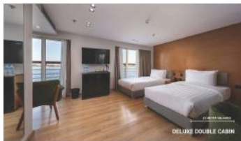
DELUXE DOUBLE CABIN (22m 2 )