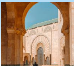
Morocco: Land of Enchantment Apr 14 - May 1, 2027