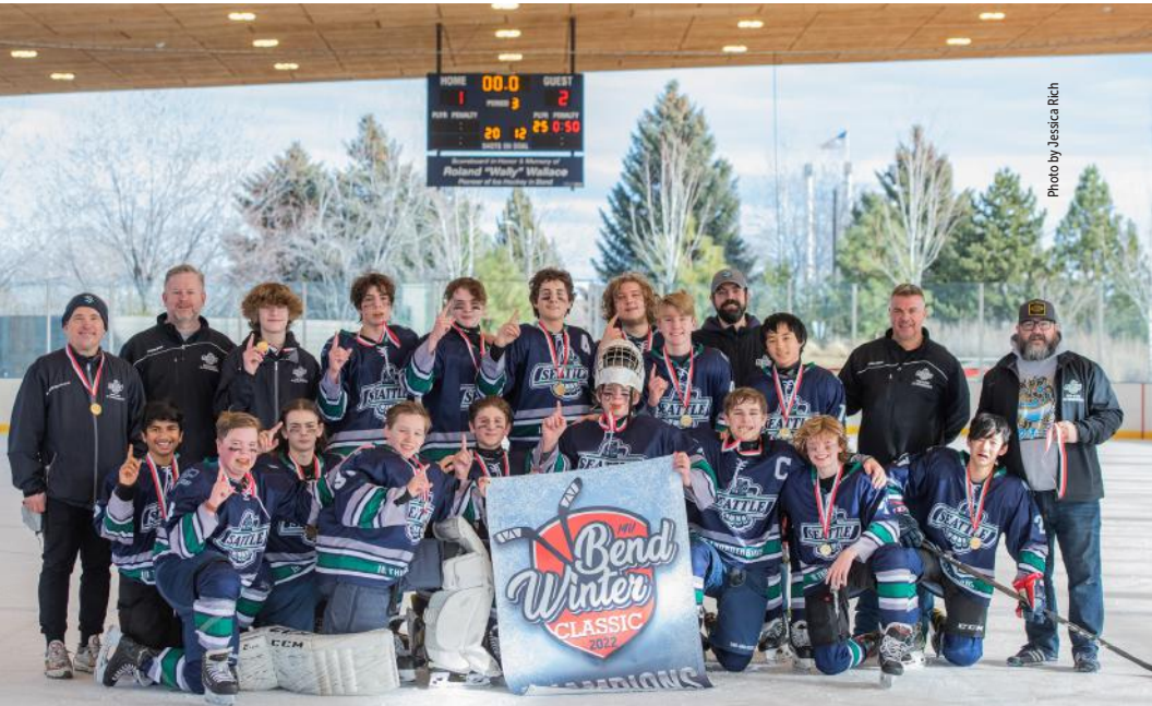
14u Division Champions: Sno-King Jr. Thunderbirds