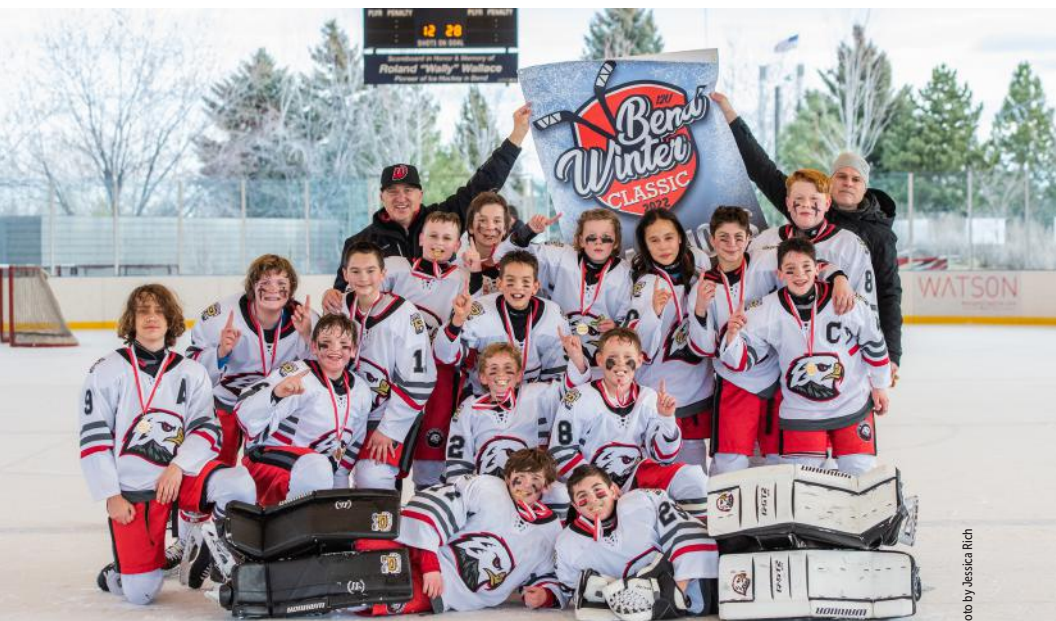
12u Division Champions: Portland Jr. Winterhawks