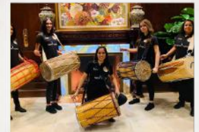
Sunday 7 May 1pm - 2pm - FREE

In celebration of the Coronation of King Charles III, Smethwick Library have invited all female Dhol drumming group Eternal Taal Entertainments. A perfect event for all the family.