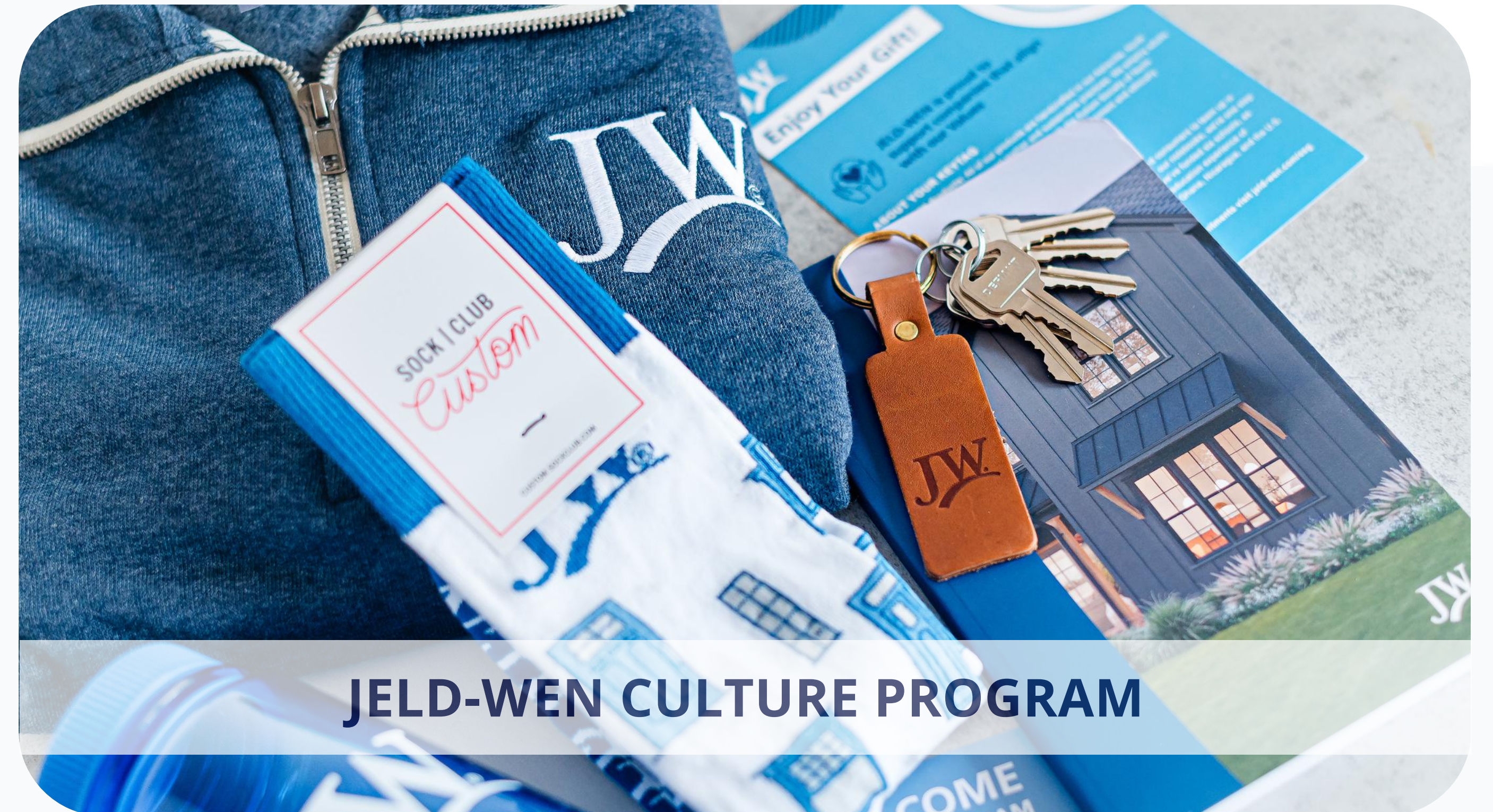
JELD-WEN CULTURE PROGRAM