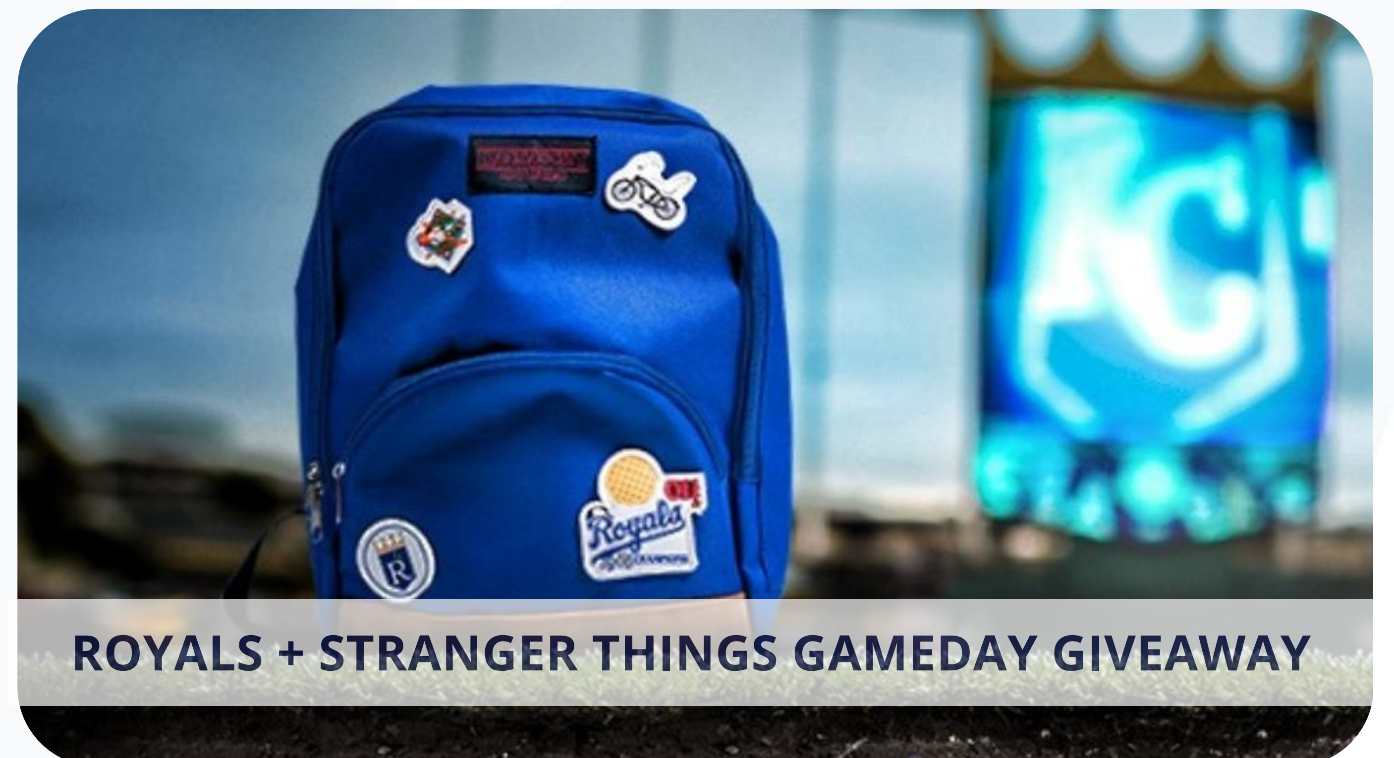
ROYALS + STRANGER THINGS GAMEDAY GIVEAWAY

Want to see more? Explore additional client stories HERE .