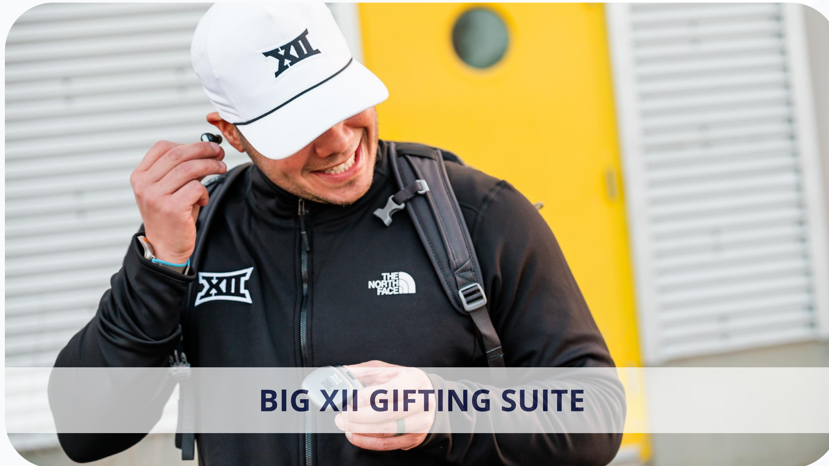
BIG XII GIFTING SUITE