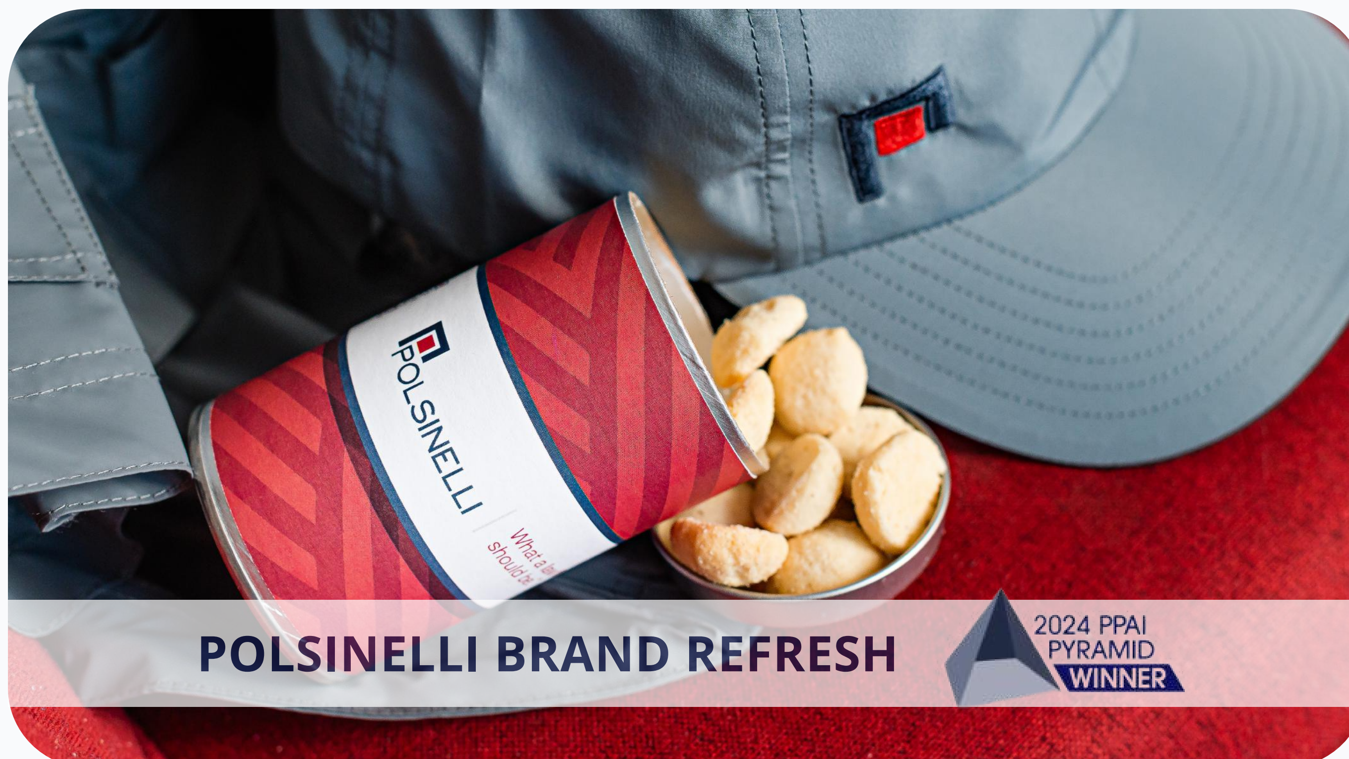
POLSINELLI BRAND REFRESH