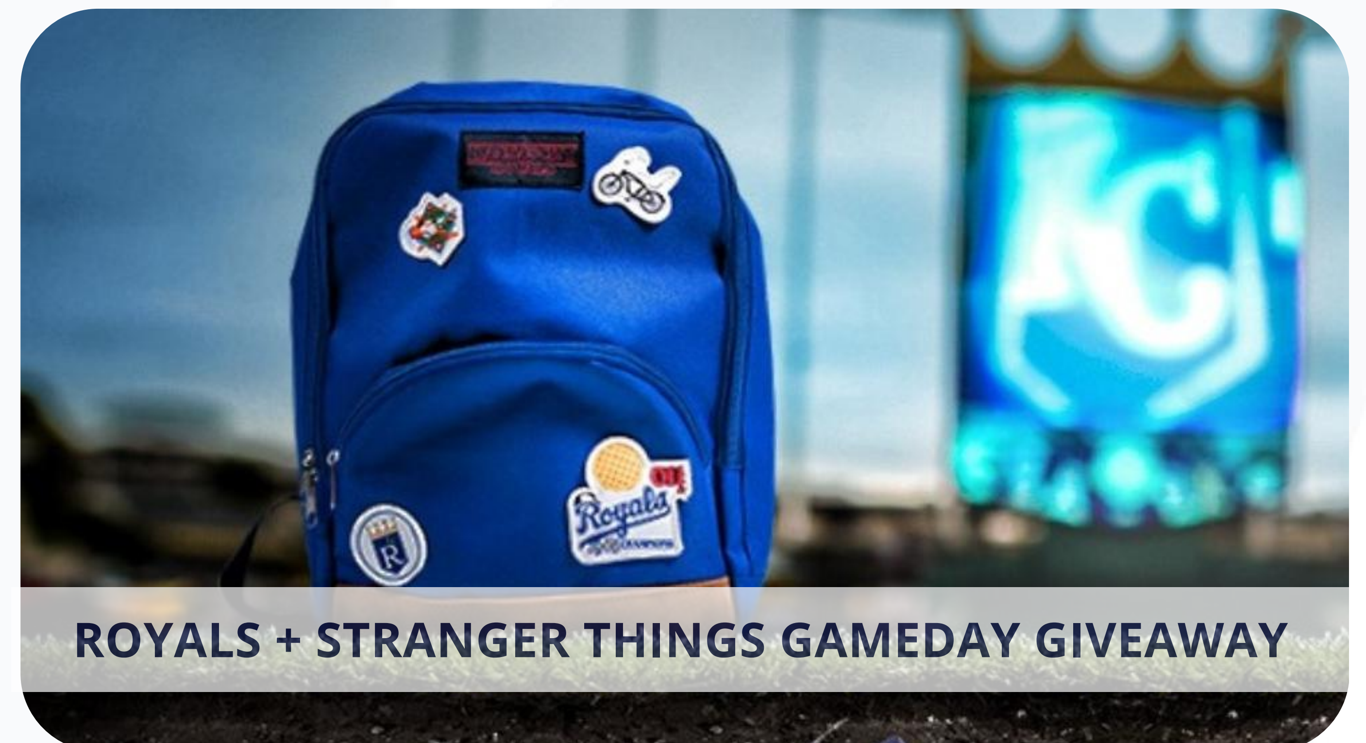
ROYALS + STRANGER THINGS GAMEDAY GIVEAWAY

Want to see more? Explore additional client stories HERE .