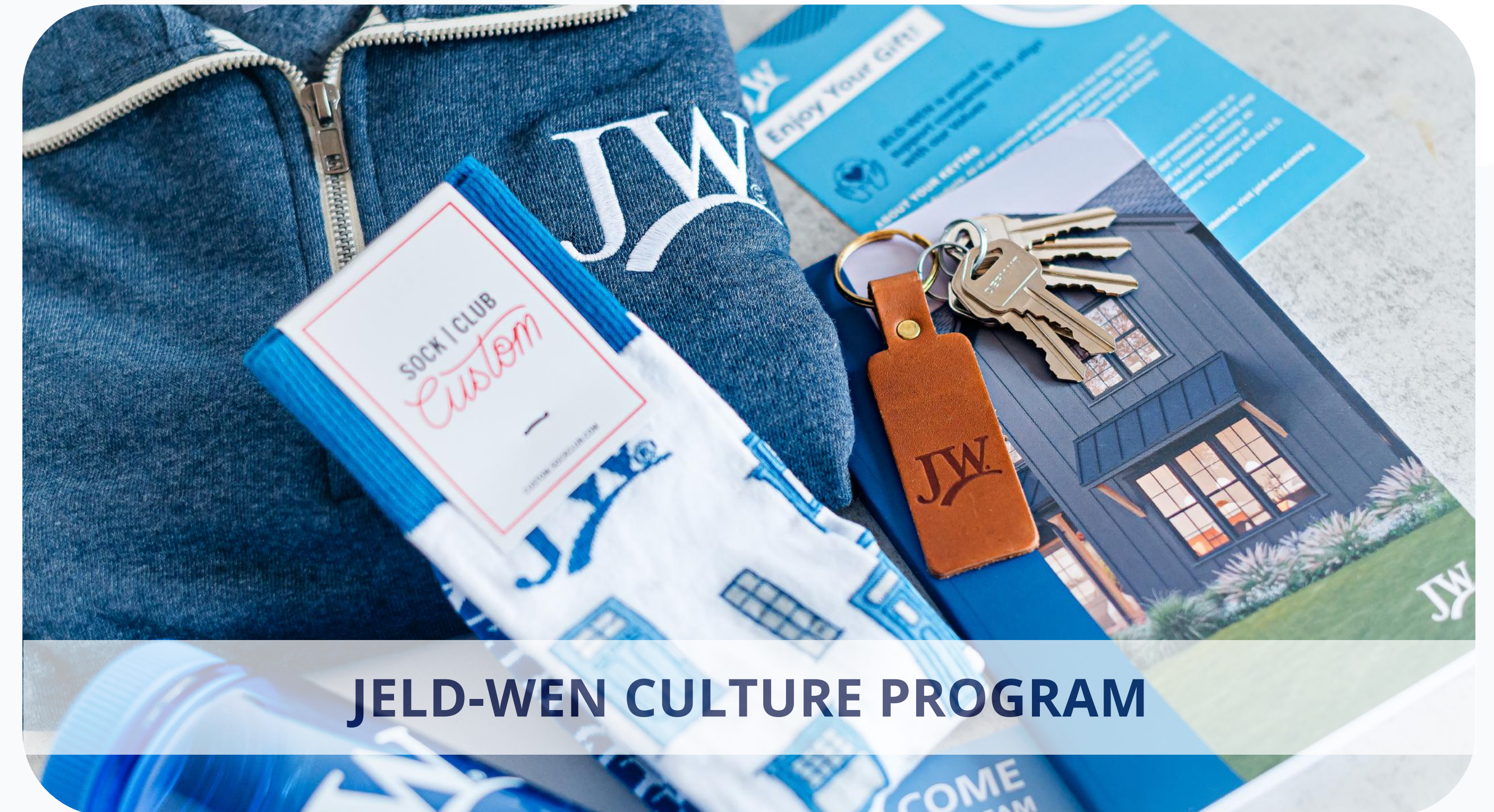
JELD-WEN CULTURE PROGRAM