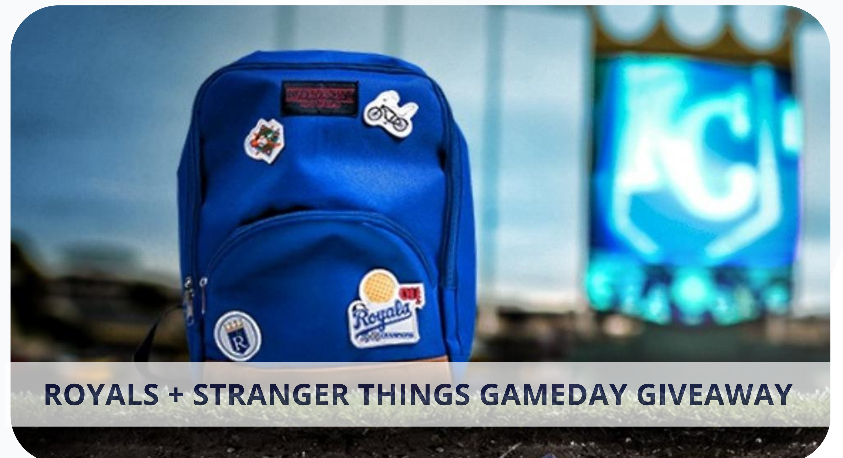
ROYALS + STRANGER THINGS GAMEDAY GIVEAWAY

Want to see more? Explore additional client stories HERE.