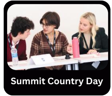
Summit Country Day