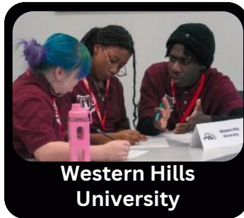
Western Hills University