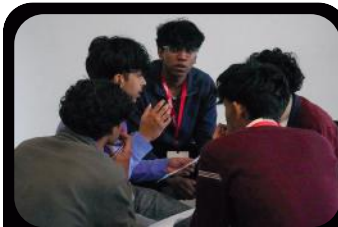
Dublin Jerome Dublin, OH