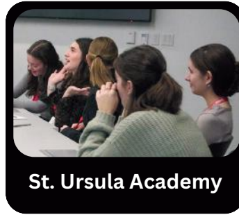
St. Ursula Academy