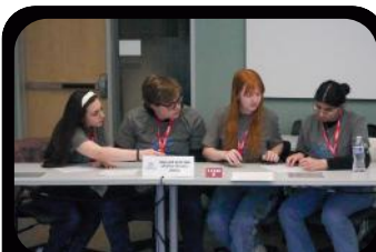
Boys and Girls Club West Chester