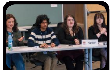
duPont Manual Louisville, KY