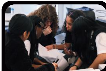
DePaul Cristo Rey