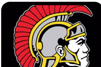
North College Hill