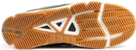
R4450 Speed TR Safety