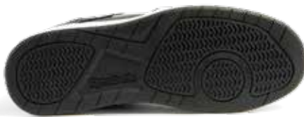
R4132 BB4500 Safety High Top