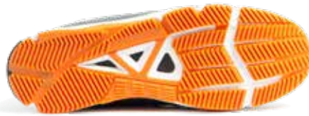
R4453 Speed TR Safety