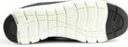
R1035 Excel Light