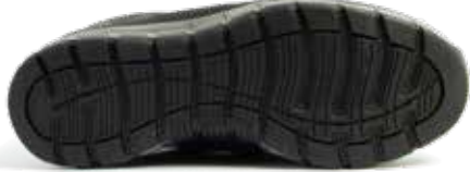
R1036 Excel Light