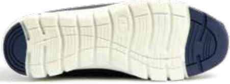
R131 Women's Excel Light