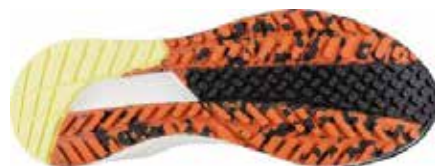
R3611 FE4 Adventure Safety