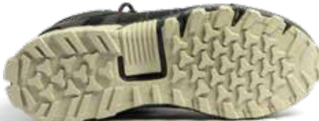
R1052 Trailgrip Safety