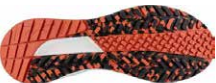
R3610 FE4 Adventure Safety