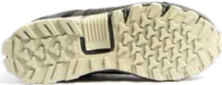
R1050 Trailgrip Safety