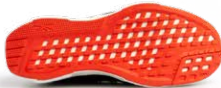
R1076 Fusion Flexweave Work