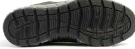
R1037 Excel Light