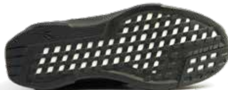
R1008/1 Fusion Flexweave Work