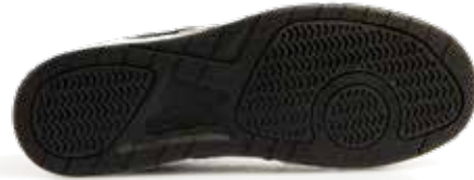
R4132 BB4500 Work Low Cut