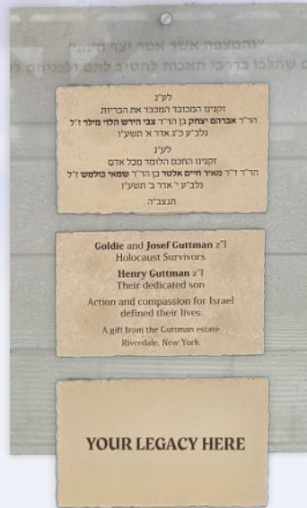
Imagine what your legacy plaque will look like

Your list of legacy organizations will be enhanced by remembering Hebron. The oldest Jewish community and the place where the grandparents of the Jewish people lived and are buried. Thousands of years strong, we aren't going anywhere. Your gift to The Hebron Fund, Inc. safeguards not only this sacred city, but strengthens the Jewish presence throughout Israel.