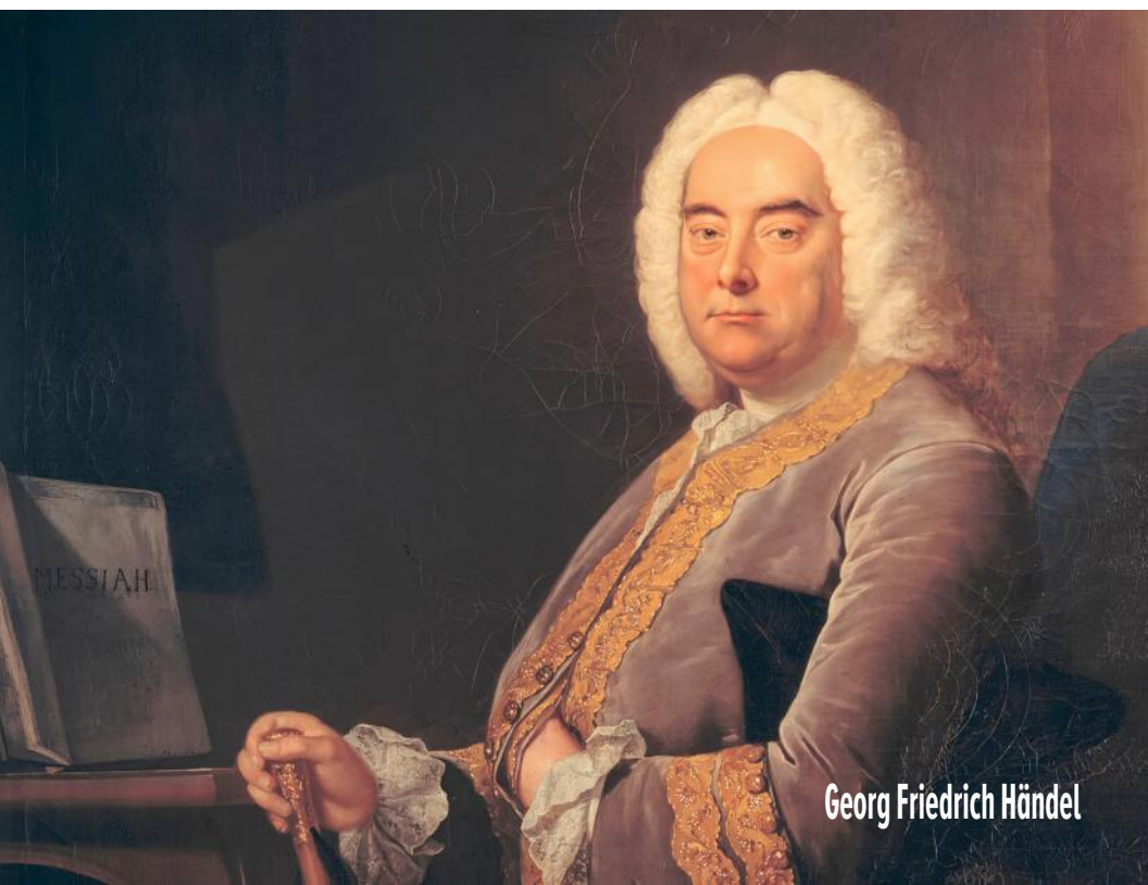
Georg Friedrich Händel