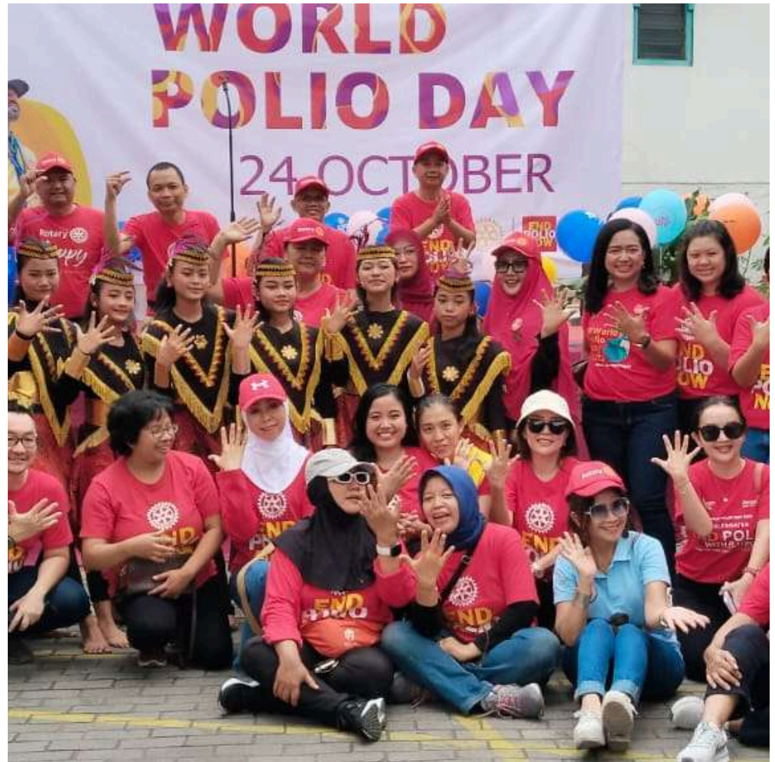
Rotary clubs area Yogyakarta

Rotary celebrated World Polio Day 2024 in Yogyakarta while also educating the public about the dangers of polio, the importance of eradication, and the need for polio vaccination.