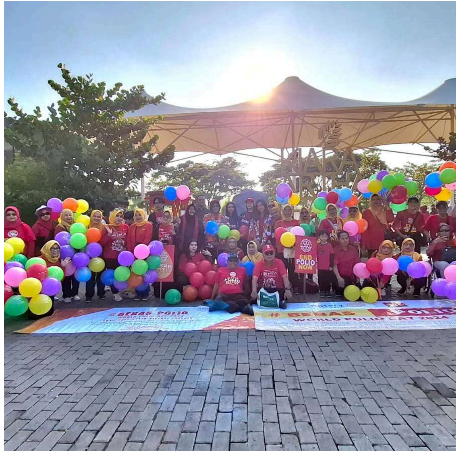
Rotary clubs area Bandung

Rotary celebrated World Polio Day 2024 in Bandung while also educating the public about the dangers of polio, the importance of eradicating it, and the need for polio vaccination.