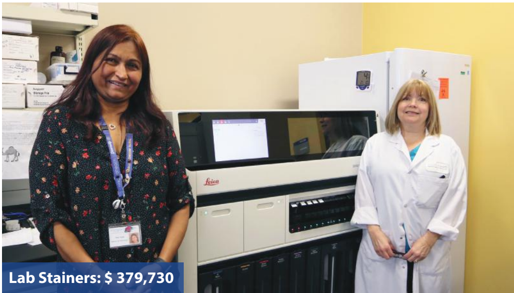
Lab Stainers: $ 379,730

“We want to thank Niagara Health Foundation donors for making a difference in people’s lives.”