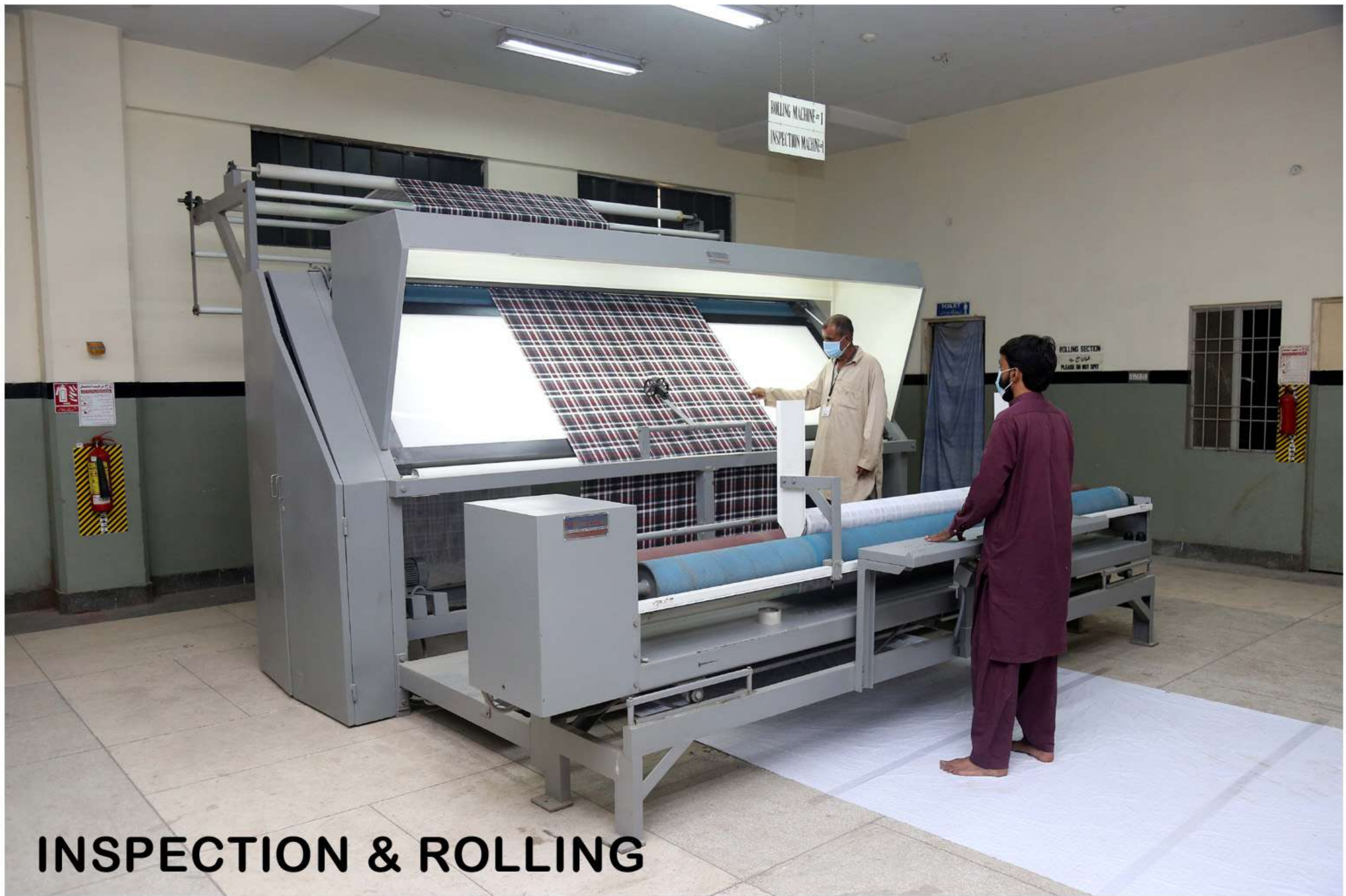
INSPECTION & ROLLING