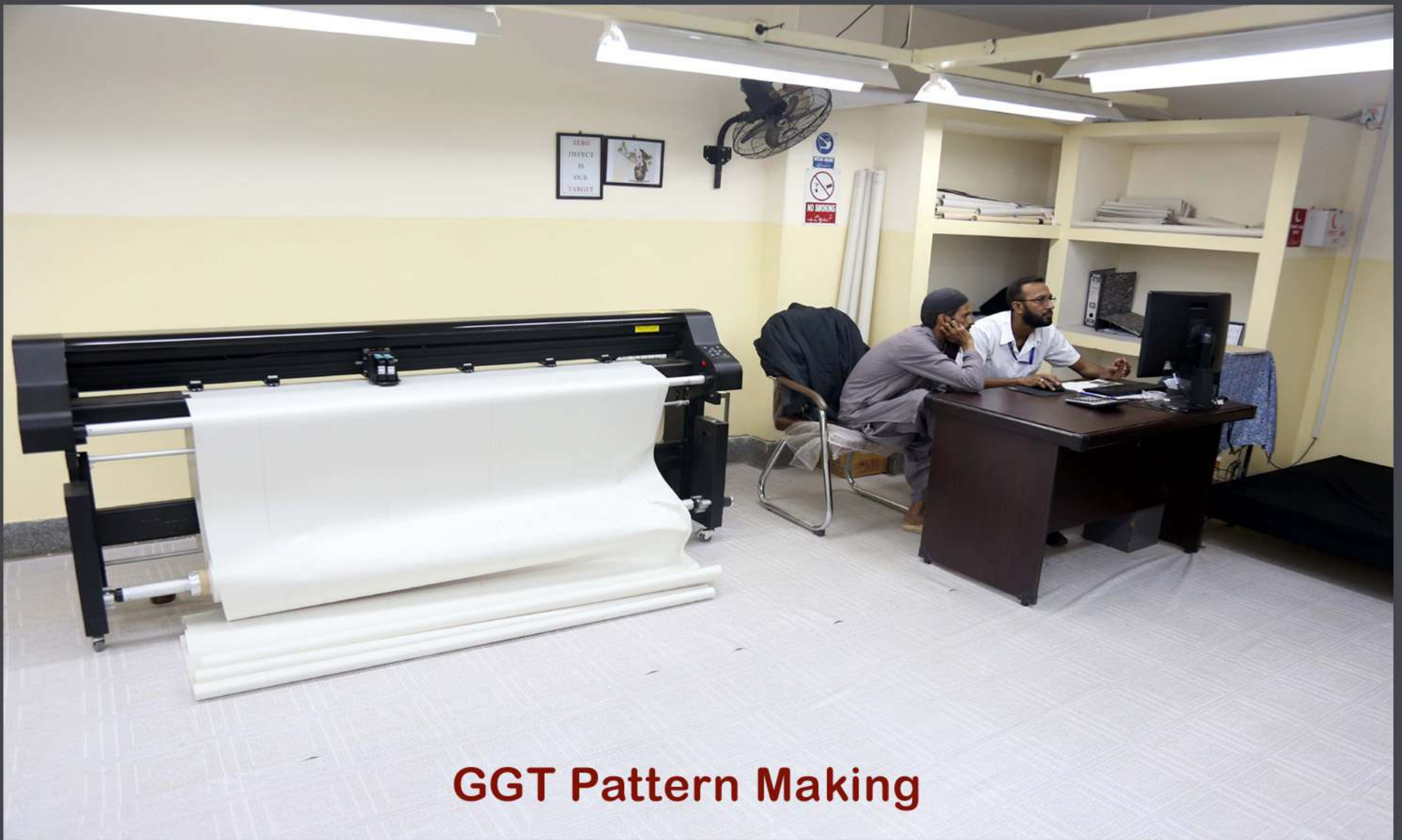
GGT Pattern Making