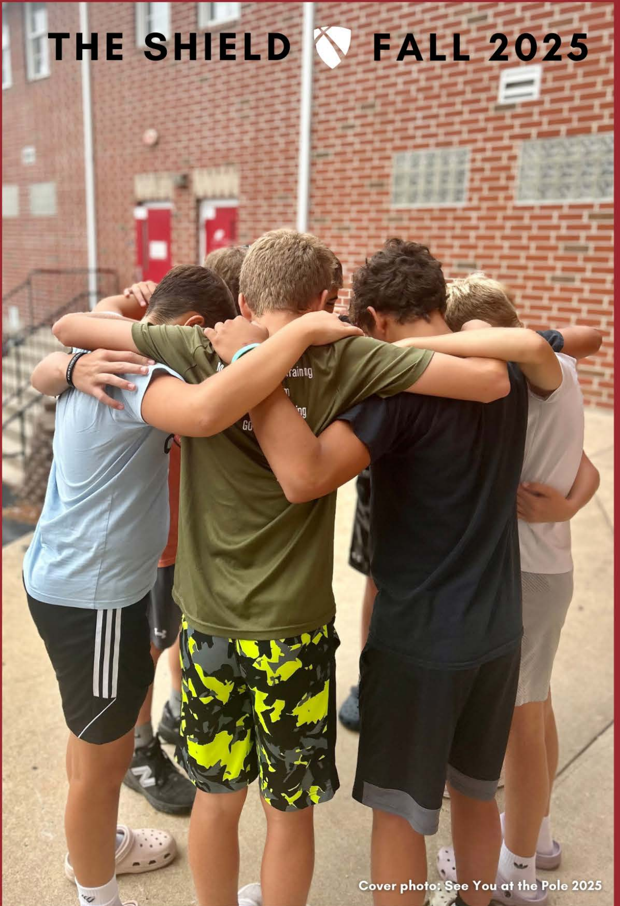
Cover photo: See You at the Pole 2025