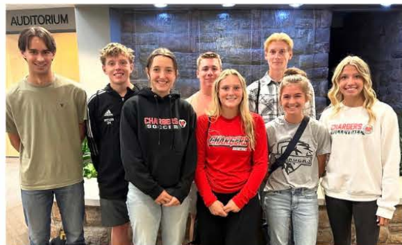
Student-athletes attended the CCAC Rise Up Sportsmanship Conference in Lancaster. The event centered around reflecting Christ in athletics through our actions and speech.