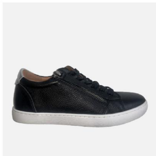
MANHATTAN Available in black and white