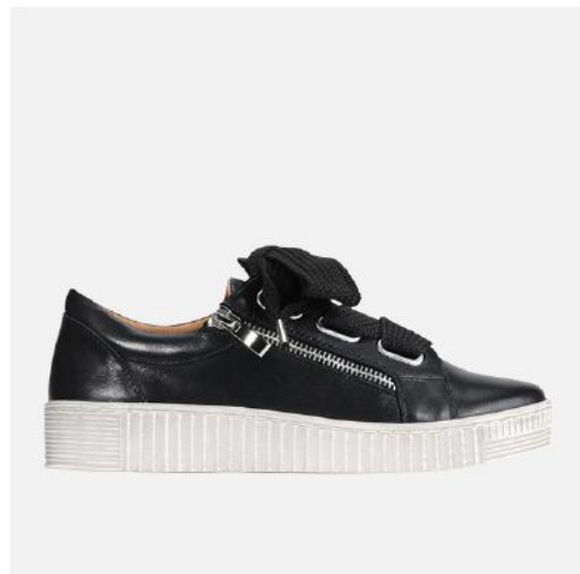
JOVI Available in multiple colours