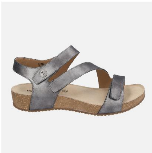
TONGA 25 PEWTER