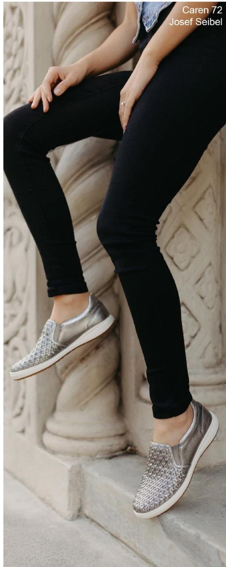
Caren 72 Josef Seibel