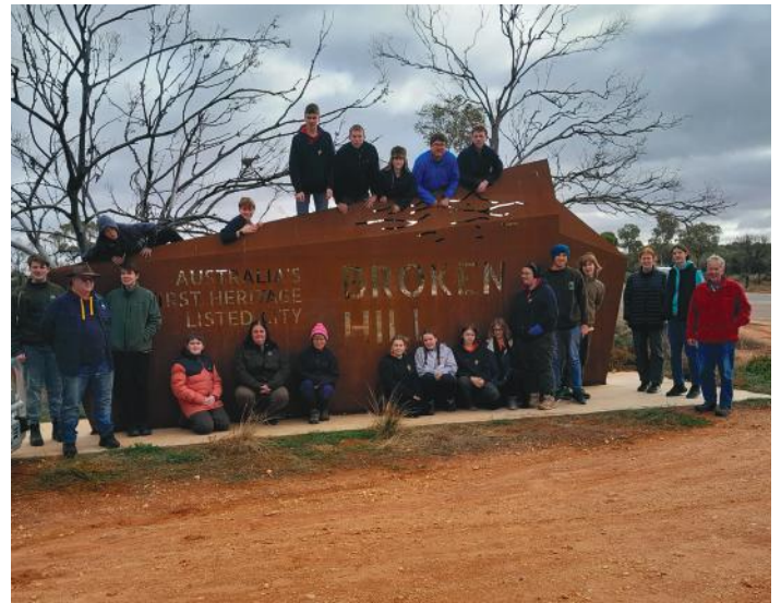
Arriving at Broken Hill sign

After our 5 nights we moved on to Penrose Park Caravan Park at Silverton. No woodchips here – just red dirt, which turned to red mud after a night of rain. Silverton turned out to be a short walk out the back gate, over the dry river course and along a track. Our activities there included visiting the