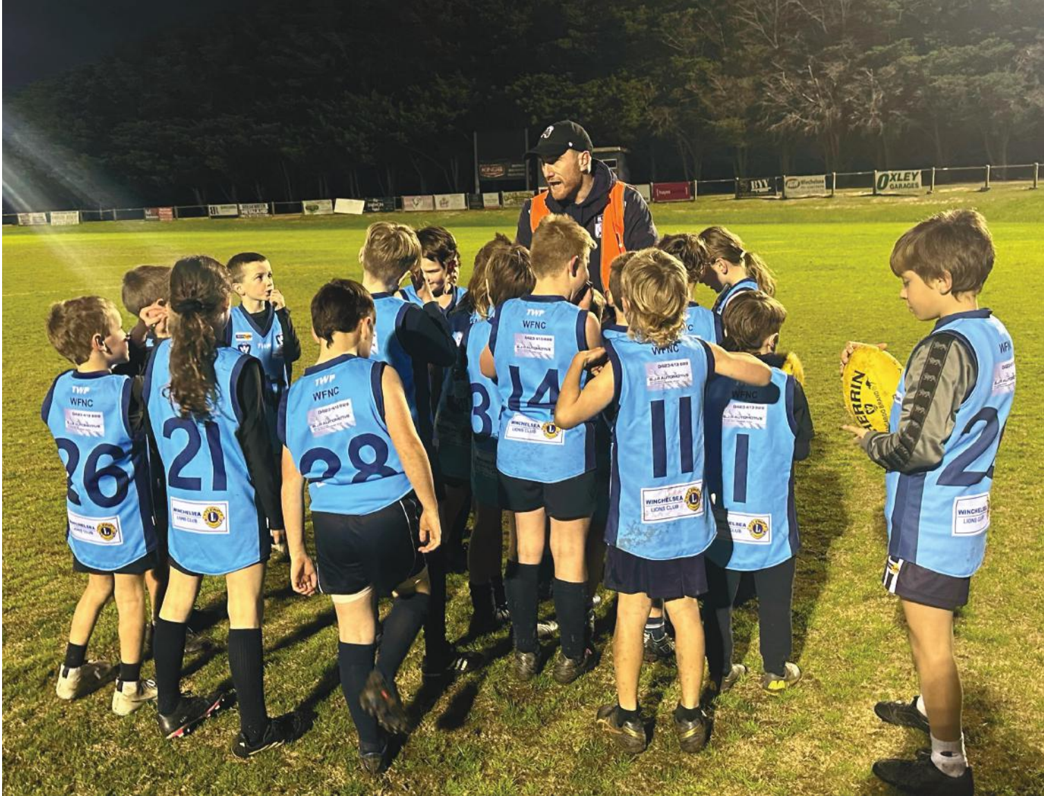
Winchelsea Under 10's