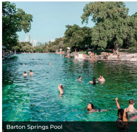
Barton Springs Pool