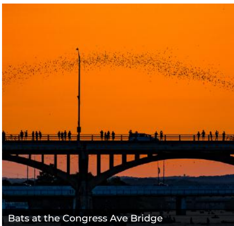
Bats at the Congress Ave Bridge

Zilker Botanical Gardens 2200 Barton Springs Rd., Austin