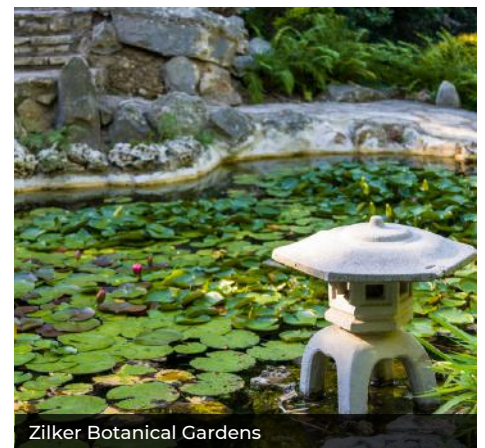
Zilker Botanical Gardens