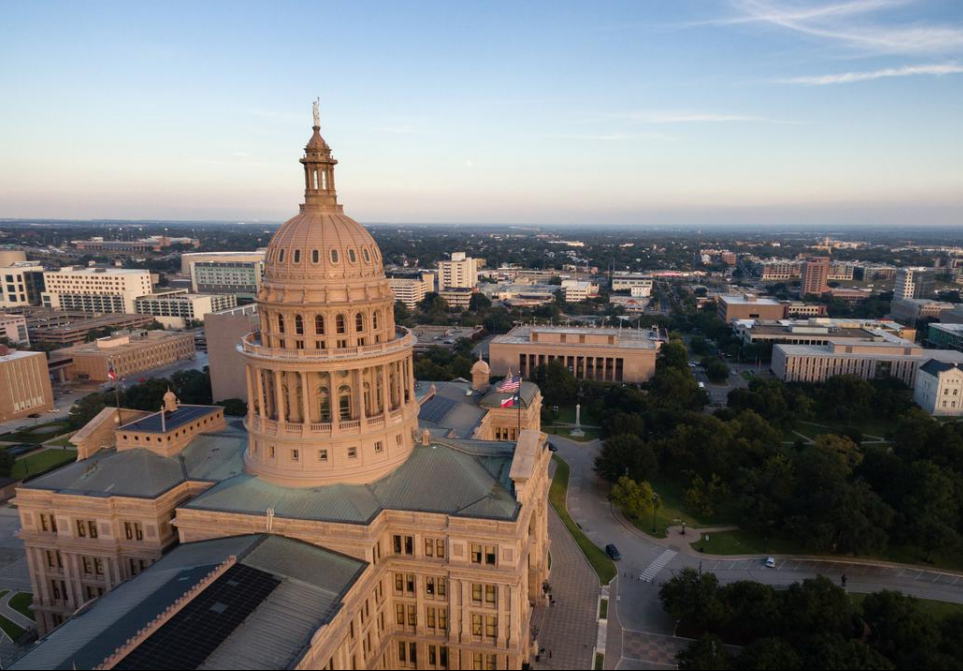
Texas State Capital