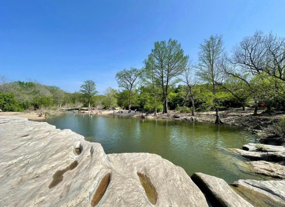
McKinney Falls State Park