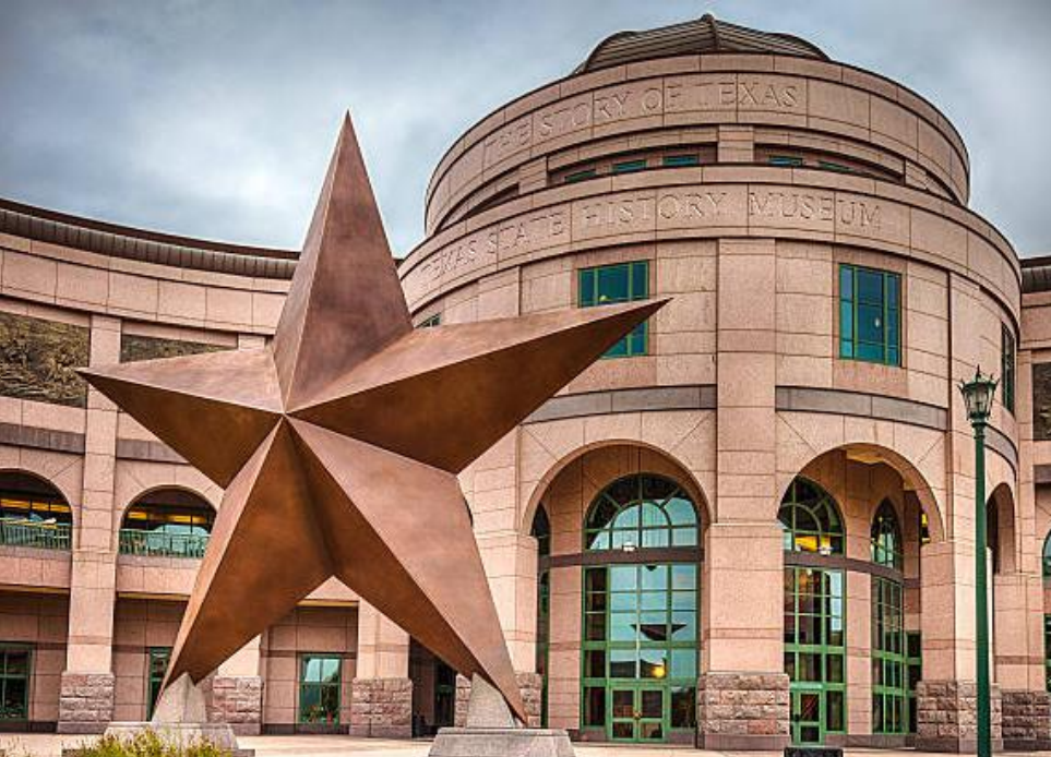
Bullock Texas State History Museum