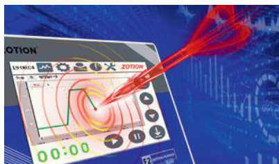
Excellent Temperature Accuracy: +/- 1°C