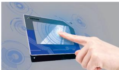
Full touch screen for easier operations