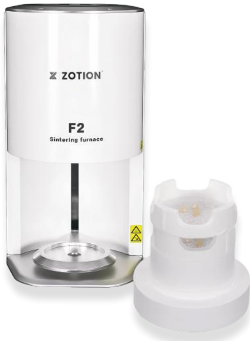
Fast Cool 2.0 Technology, cools down the furnace quickly without damaging the unit

Zotion Economic dental Fast Sintering Furnace F2 consist of a double shell structure with excellent insulation. The specially designed structure ensures that the furnace can achieve fast heating and cooling procedures, providing a cleaner working environment during sintering process. It can sinter zirconia block, glass ceramics and glazing.