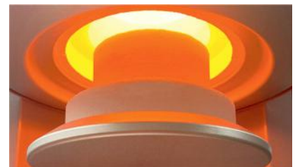
Maximum Heating Rate is 100°C per minute