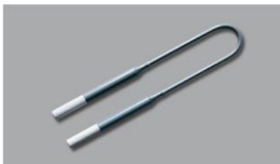
Silicon-molybdenum rods to generate heat