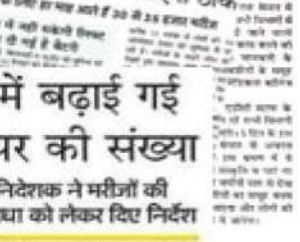
सुन: मेडिकल कॉलेज के अस्पताल के लिए टैलिकॉम उपकरणों में बढ़ाई पुरानी का किताब टीका