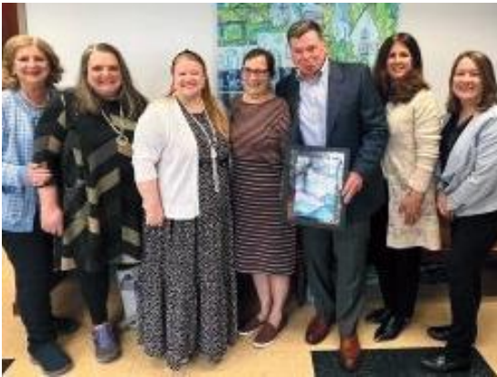
Founding Members of the St. Mary's Conference in Rome, Georgia.