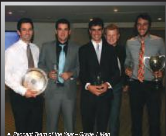
▲ Pennant Team of the Year – Grade 1 Men

A pair who knows plenty about finals success with the Club received their trophies for taking out the Margaret Court Team Cup for winning the women's Open doubles title.