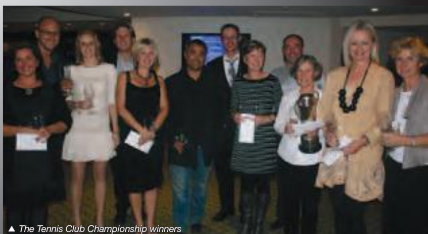
▲ The Tennis Club Championship winners