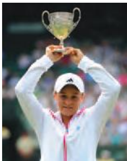
▲ Wimbledon Junior Champion Ashleigh Barty

Next year the Kooyong Foundation will celebrate its 10th birthday and Kooyong members have every reason to feel a deep sense of satisfaction at what our club has been able to achieve through the Foundation's work, both on and off the court.