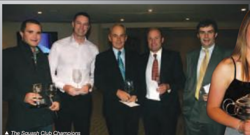
▲ The Squash Club Champions