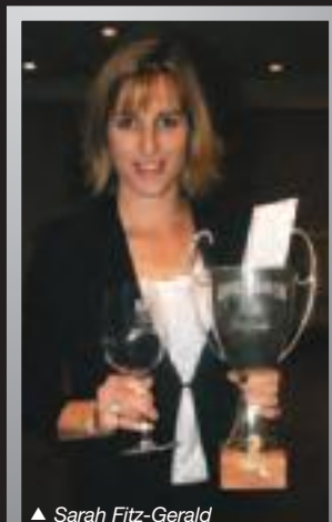
▲ Sarah Fitz-Gerald