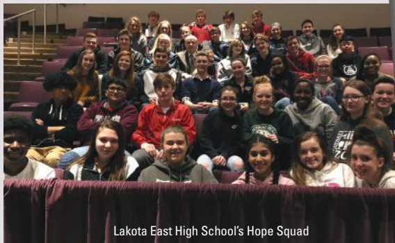
Lakota East High School's Hope Squad

initiated by Lakota's District Parent Council. Both tip lines help to promote the "see something, say something" message. Safety and security in Lakota also includes the mental health of our students. Following last year's launch at the high schools, Lakota's four junior schools have already begun planning for their own Hope Squads. Furthermore, building upon last year's pilot at Lakota West, access to mental health services will expand to include more buildings through the district's partnership with MindPeace. Additional efforts, which have not been announced publicly for safety reasons, are being reviewed and implemented as well.