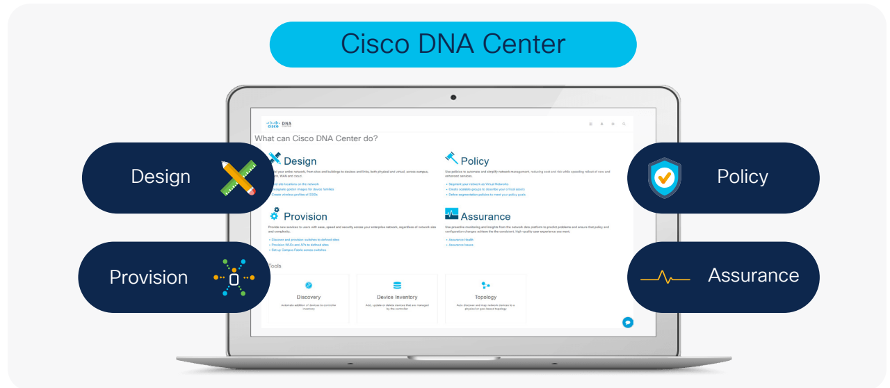
Figure 3. Pictured, the command center for Cisco DNA Center and the features provided.

The command center for your wireless network needs to be as reliable and secure as the devices it controls. From management to automation to analytics to security, Cisco DNA Center runs your network, provisioning and configuring all of your network devices in minutes. No more making sure that each device is up-to-date with what you need it to do; Cisco DNA Center takes care of all that, automatically.