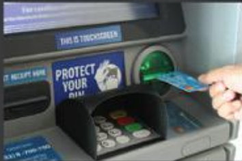
ATM (Metro Bank)