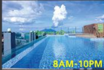
Infinity Pool & Jacuzzi