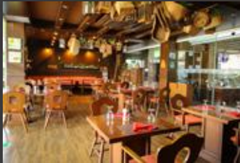
Zermatt Restaurant & Bakery