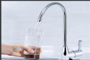
Filtered Tap Water