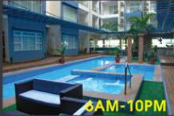
Ground Floor Heated Jacuzzi