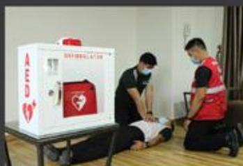
Defibrillator & Trained Staff

Experience the distinctions of La Grande Residence. Call +63 922 375 8679 or email us at reservations@lagranderesidence.com for your inquiries and reservations requirements