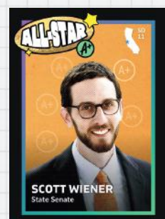
Scott Wiener San Francisco Score: 100