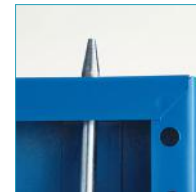
Three point locking for secure storage.