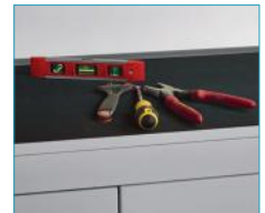
Dished top available on half height cupboard.