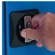
Handle is designed for easier operation; allowing the door to close without the key.

All painted components are protected with a powder coating which incorporates ActiveCoat anti-bacterial technology.