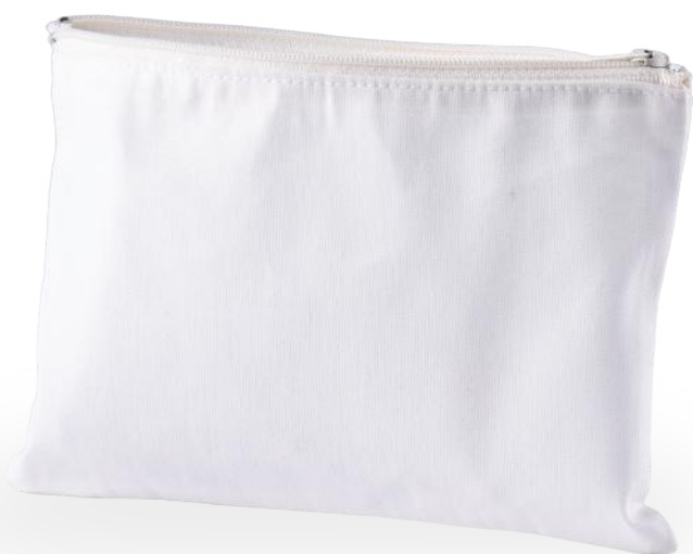
Zip closure Smooth access. Secure hold.