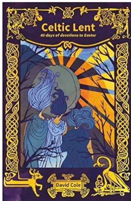
Celtic Lent by David Cole

The Little Book of Lent is a powerful anthology of readings from spiritual writers for each day of Lent, with accompanying scripture and prayers to help guide daily reflections.