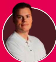
Organisation Robin Hut

Our Fan Support team is easily recognizable in and around the stadium, as well as in our House of the Devils. Feel free to approach them if you have any questions or problems.