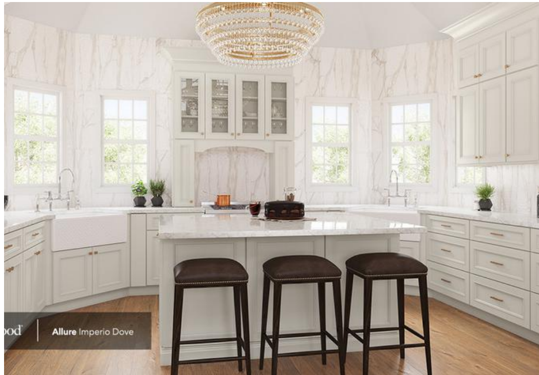
ood Allure Imperio Dove