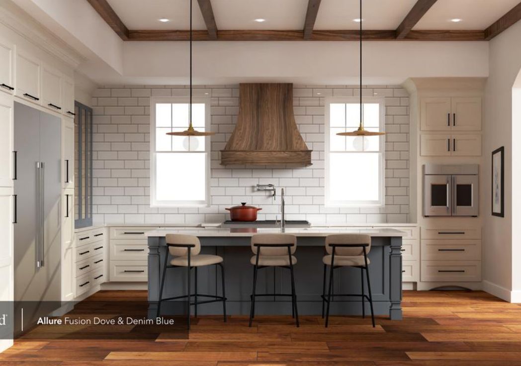
Allure Fusion Dove & Denim Blue