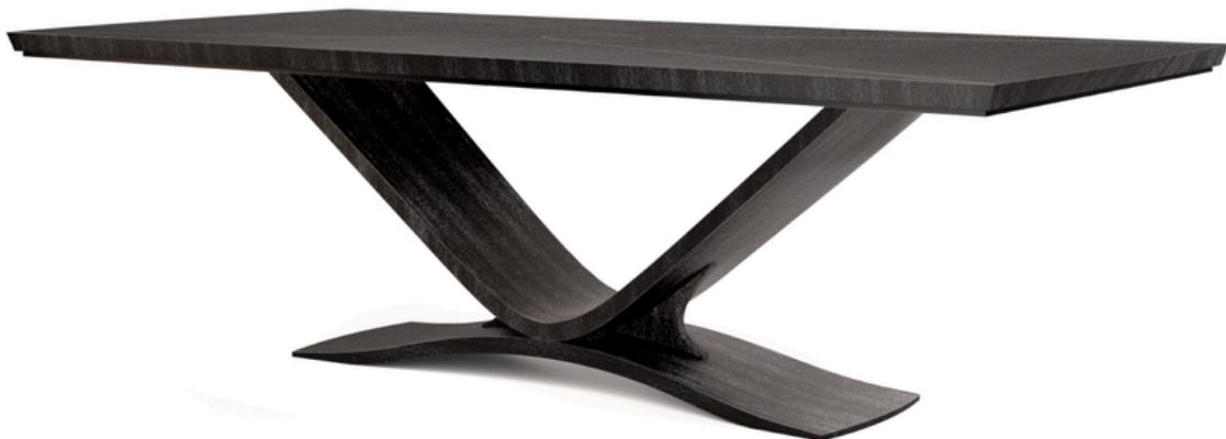
Delpine Dining Table