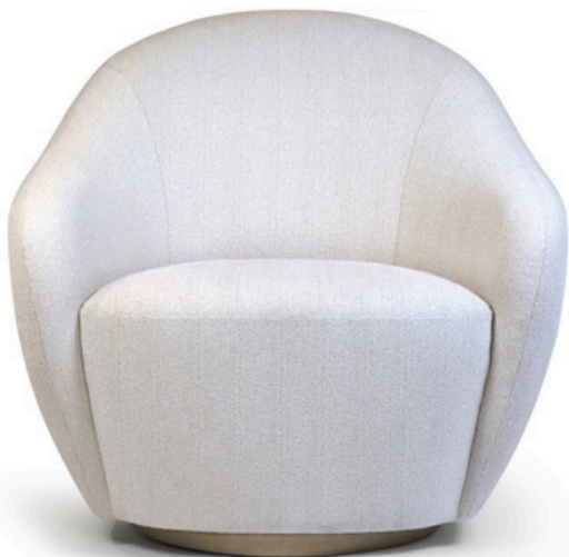
Cora Swivel Chair