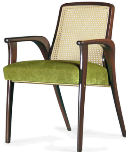
21/50 Arm Chair