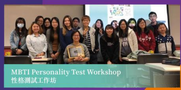
MBTI Personality Test Workshop 性格測試工作坊