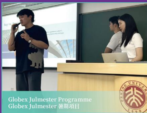
Globex Julmester Programme Globex Julmester 暑期項目

短期校外學習課程豐富學生整體的學習體驗。在學院的支持下，部分學生參加境外培訓或暑期課程，如 Globex Julmester 暑期項目，到北京大學進行訪問學習。濃厚學習氛圍有利學生的專業發展。