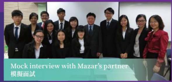
Mock interview with Mazar's partner 模擬面試

學生精進計劃旨在為參與的商科學生，加強學習、領導才能、個人網路，和全人發展。活動包括內部研討會、工作坊、實地考察和參觀企業等等。