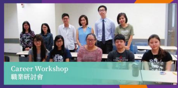
Career Workshop 職業研討會