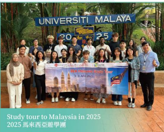
Study tour to Malaysia in 2025 2025 馬來西亞遊學團